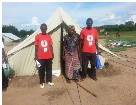
Erected shelter in Nsanje district.

Technical work has progressed well in shelter, WASH and logistics as well. A design for a suitable and safe family shelter, made from only 2 tarpaulins and some wooden poles, has been completed, and training of trainers is now being rolled out among MRCS volunteers on how to erect it properly with the materials and tools which will be provided. This shelter will afford good protection, even from driving wind and rain. By 10 February, more than 100 volunteers will have been trained. The distribution and implementation plan for this is almost complete.