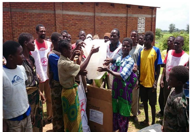
Relief items being distributed in Nsanje district.

Emergency shelter is the biggest need, with non-food household items (bedding, hygiene provisions and kitchen items) the next in line. Many people are still complaining of a lack of food availability: WFP, with their implementing partners, are gradually getting round to all the sites with some provisions, but there were challenges. Maize was distributed rather than flour and milling was a problem due to lack of electricity supply or fuel. Some soya, wheat or maize flour is now being distributed, as well as pulses and oil (cereal, pulses and oil). Nutritional status data is too sketchy so far to be of any use in terms of seeing a downward trend, but this will need to be monitored carefully since there were many school feeding programmes in the region beforehand and that it is lean season, both indicate that the under-5 population will be vulnerable.