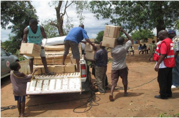
Offloading of NFIs for distribution in camps.

firewood supply is a factor in exacerbating the disaster risks of flooding and landslides, as well as reducing crop productivity.