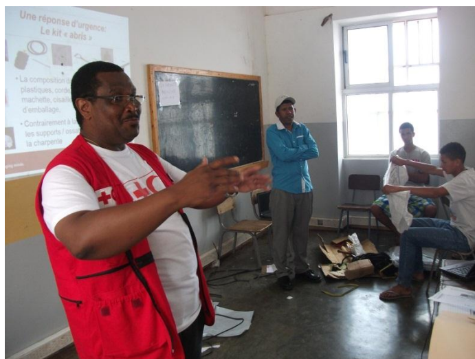
Ongoing shelter training facilitated by CVRC DM