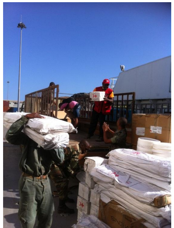
Loading off NFIs from shipment.