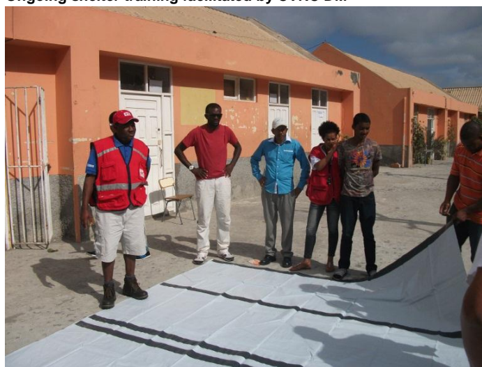
Practical shelter training exercise with the RDRT.