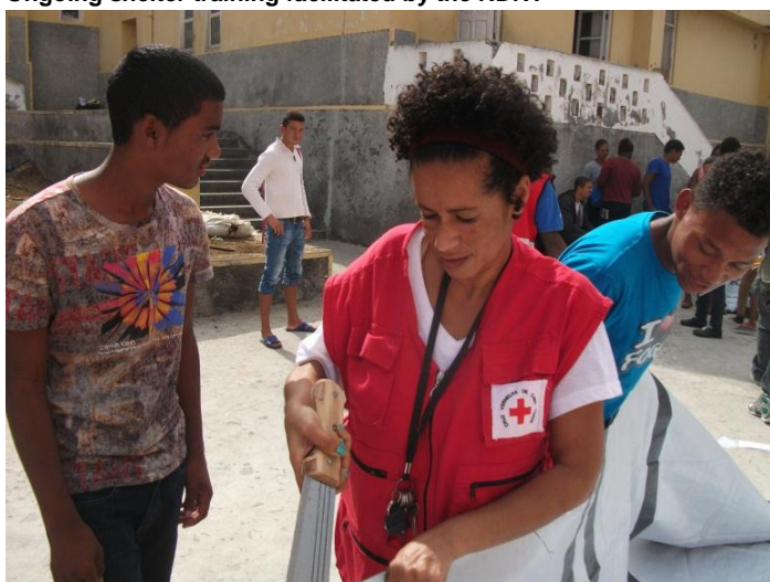
Practical shelter training exercise