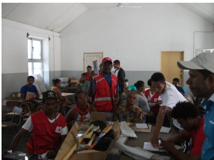
Ongoing shelter training facilitated by the RDRT