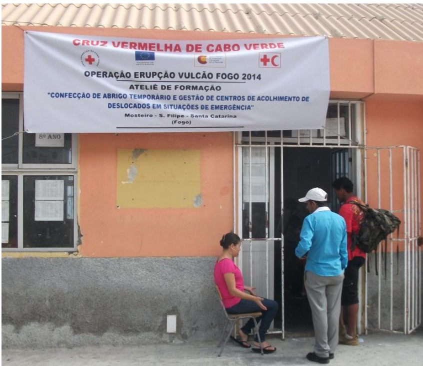
Site where shelter training took place for volunteers

This DREF has been replenished by DG ECHO and the Spanish Red Cross/Government AECID. The major donors and partners of the DREF include the Red Cross Societies and governments of Australia, Austria, Belgium, Canada, Denmark, Ireland, Italy, Japan, Luxembourg, Monaco, the Netherlands, Norway, Spain, Sweden and the USA, as well as DG ECHO, the UK Department for International Development (DFID) the Medtronic, Zurich and Coca Cola Foundations and other corporate and private donors. The IFRC, on behalf of the Cape Verde Red Cross Society (CVRC) would like to extend many thanks to all partners for their generous contributions.