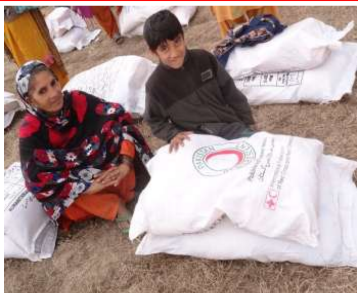
PRCS will support 10,000 flood affected families with food assistance.

26 February 2015: Reissued the Emergency Appeal with minor adjustment to the budget – CHF 1,122,723, with no change to the plan.