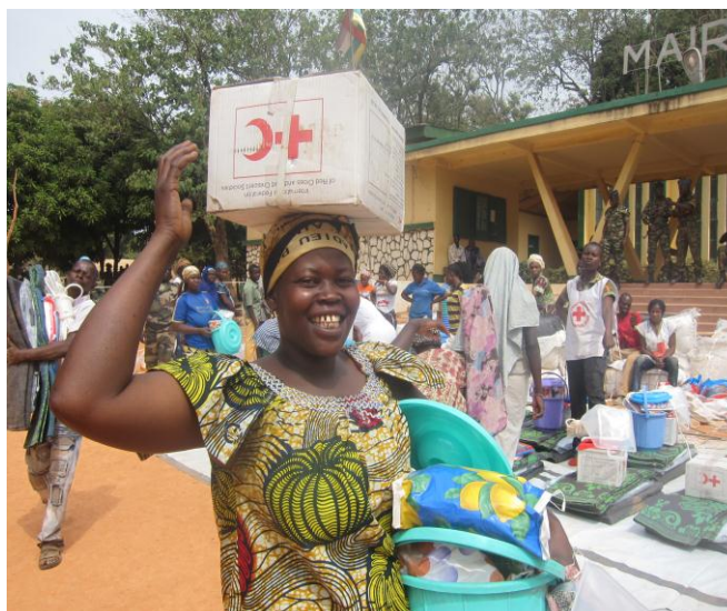
A displaced woman full of joy, after receiving NFIs from the CAR RC at Bouar

The most affected areas remain Bangui, Boda, Boganagone, Bouar, Carnot, Berberati, Paoua, Grimari, Yaloke, Bossangoa, Dekoa, Sibut, Bria, Ndele, Ippy, Markounda, Kaga-Bandoro, Ouango, Alindao, Kabo, Moyen-Sido, Batangafo and Bambari RCA 2014/rapport de mission d'évaluation à Grimari.doc . From the onset of the conflict, the situation in Bangui and the provinces has remained volatile and unpredictable. The country continues to be rocked by attacks and counter-attacks between the rival groups, impacting upon civilians and humanitarian workers and, thus, increasing the numbers of people in need of humanitarian support. The United Nations Office for the Coordination of Humanitarian Affairs (UNOCHA) estimates that at least 2.5 million people in CAR are in urgent need of humanitarian aid and protection.