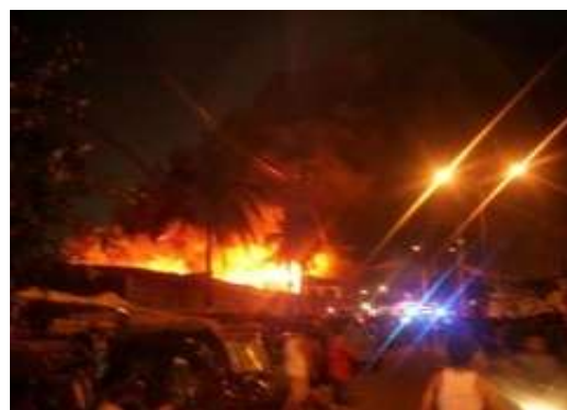
During the hot and dry season, fire often breaks out in communities that find it hardest to recover, often due to urban poverty and lack of public services.

Responding to the fire, PRC has deployed two staff members, 20 volunteers and 11 disaster response teams to the affected sites. A water tanker from the PRC National Headquarters (NHQ) was also deployed together with an emergency medical team to support government efforts in putting out the fire and providing essential medical and/or ambulance services to those affected. PRC also continues to provide a range of welfare services to affected people in evacuation centres.