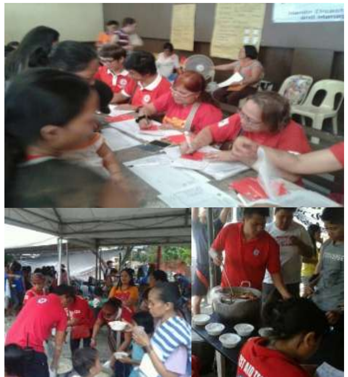
The PRC set up welfare desks and hot meal services for people affected by the fires in the Manila area. Now, during this “fire season”, the potential for fire breakouts is high, and requires extensive 24/7 preparation on the part of the National Society.

The month of March is generally hot and dry, traditionally the “fire season” in the Philippines, and is declared Fire