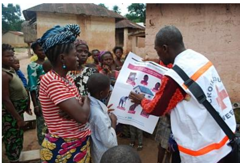
To help stop the spread of Ebola, Red Cross volunteers in Guinea are visiting communities to meet with residents face-to-face. They sensitise people to change attitudes and practices that could spread the virus like here in the village of Kolebengo, one of the most resistant villages in Gueckedou.

Six emergency appeals were launched to combat Ebola Virus Disease (EVD) outbreaks in Guinea, Liberia, Sierra Leone, Nigeria and Senegal, while providing coordination and technical support at the regional and global level.