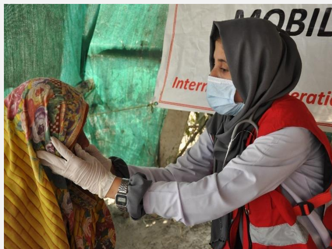
A doctor inspects a flood affected person at a medical camp during flood emergency response phase

Deployment of Mobile Health Teams (MHTs): IFRC and NorCross expanded their MHTs coverage by deploying 11 teams (IFRC 9, Norcross 2) in Sindh and KP, while ICRC supported the response by deploying 12 MHTs in Balochistan and KP till January 2023. The same MHTs were supported by IFRC for an additional three-month duration. These MHTs play a crucial role in providing essential healthcare services in the flood-affected areas. The MHT activities continued until March 31, 2023, to meet the ongoing healthcare needs of the affected communities.