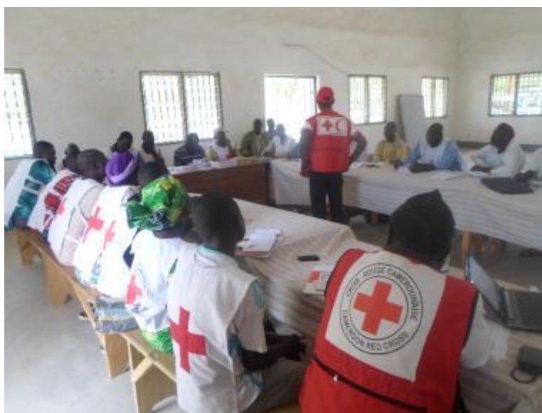
Volunteer training session in the locality of Mokolo, Far North Region.

Since July 2014, a large number of Nigerian refugees have been crossing the border into Cameroon, fleeing armed clashes. So far, about 35,000 refugees have been registered by UNHCR. About 30,000 internally displaced persons (IDPs) have also been reported, following clashes at the border where some villages and towns have been attacked. In a bid to assist these vulnerable persons, this emergency appeal was launched for 25,000 beneficiaries (5,000 refugee families that have fled Nigeria to Cameroon, Cameroon-based IDPs, and host communities in the Far North Region). Targeted sectors of intervention include health activities that specifically focus on the chronically ill, pregnant women, the disabled, and the elderly, WASH activities, hygiene promotion and awareness campaigns in communities and inside Minawao camp to equally benefit refugee and host communities, food security, nutrition and livelihoods support for 1,000 families in order to improve their agricultural capacity, and various training sessions covering planned intervention topics aimed at building the capacity of volunteers.