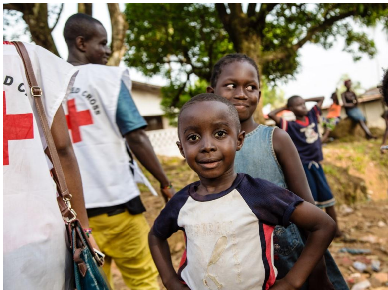
Liberia, Monrovia: Young community members join a Red Cross community engagement and social mobilisation session.

Six emergency appeals were launched to combat Ebola Virus Disease (EVD) outbreaks in Guinea, Liberia, Sierra Leone, Nigeria and Senegal, while providing coordination and technical support at the regional and global level.