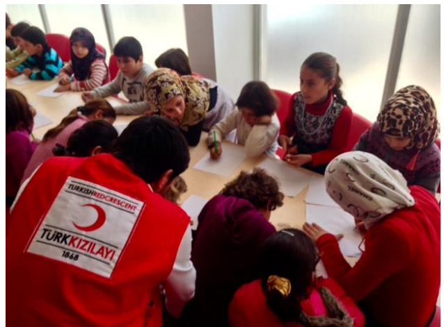
Group of children attending psychosocial activities during a monitoring visit in February 2015.

In addition to those child-oriented activities, focus group meetings and baseline survey finalized in February 2015 showed the need of increasing the scope of services offered by the centre to address the needs and requirements of the target population. Hence, the community centre is currently offering Turkish language lessons in order to promote the integration of Syrian people into the host community. In the same sense, some of the activities projected in the future like computer lessons and vocational training target mainly