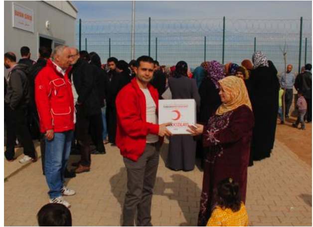
Distribution of hygiene kits in Malatya. Red Cross and Red Crescent Movement coordination allows addressing the hygiene needs of the nearly 240,000 people living in protection camps across Turkey.

From this amount, provision was made for an increasing distribution capacity in case of a newly arriving population. Given the emergency situation caused by massive population displacement from Kobane, 12,412 hygiene kits were distributed to families settling in temporary shelters around Sanliurfa province.