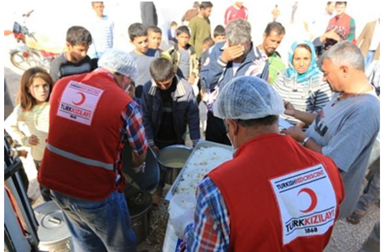
Distribution of hot meals at the Turkish – Syrian border.

On 19 September 2014, the Turkish Red Crescent began an emergency relief distribution for Syrian people fleeing from the town of Kobane (Ain Al-Arab) into the border town Suruc. By 1 October 2014, a mobile kitchen was deployed and has since then been carrying out hot meal distribution for up to 17,000 people per day, including people sheltered in temporary settlements supported by Turkish Government and in other areas of Sanliurfa province, where some of the 160,000 people crossing the border had dispersed. In order to boost the Turkish Red Crescent's national response capacity, the IFRC Secretariat and the Norwegian Red Cross contributed with the support for the acquisition of two mobile kitchens.