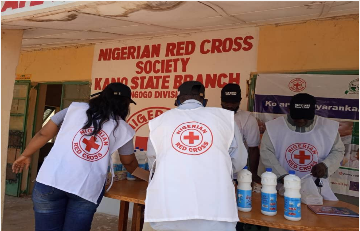
Nigerian Red Cross team conducting distribution of hygiene kits in Kano State, the epicentre of the outbreak