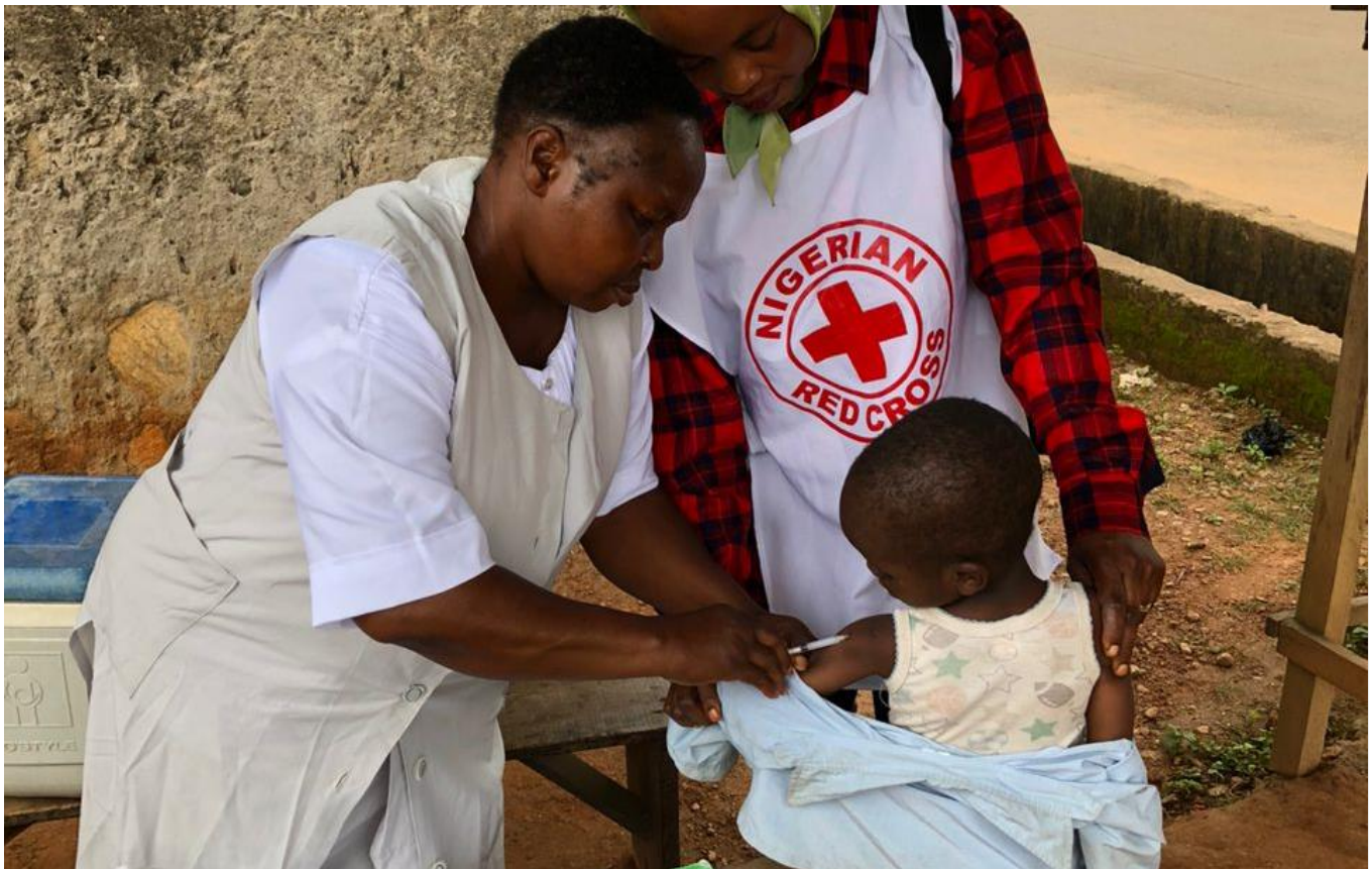
Nigerian Red Cross team supporting vaccination through RCCE activities in Osun state Nigeria.

To date, this Emergency Appeal, which seeks CHF 5,4million, is 1 per cent funded. Further funding contributions are needed to enable the Nigerian Red Cross Society with the support of the IFRC, to continue with the operation.