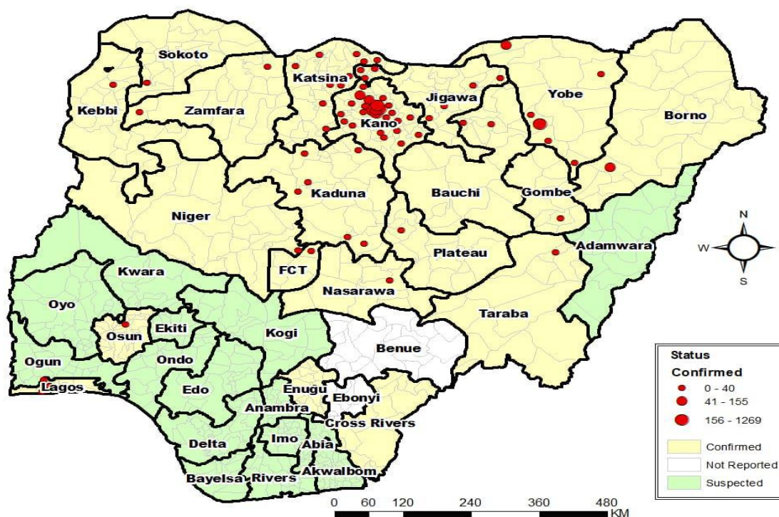
Map of Nigeria showing caseload of Diphtheria for EPI week 47.

Diphtheria is a severe bacterial infection that can affect a person's nose, throat, and occasionally skin. It is brought on by the bacterium Corynebacterium species. The people at the greatest risk of contracting diphtheria are among children and people who have not received any, or only a single dose of the vaccine (a diphtheria toxoid-containing vaccine). People at risk are communities residing in densely crowded places and unsanitary areas with poor environmental conditions. Also, healthcare professionals and hospital frontline workers who are working with or in close contact with people suffering from Diphtheria are at risk of contracting the disease. There is also a huge risk of contracting diphtheria if a person comes physically into contact with someone with diphtheria and hence can be spread from person to person.