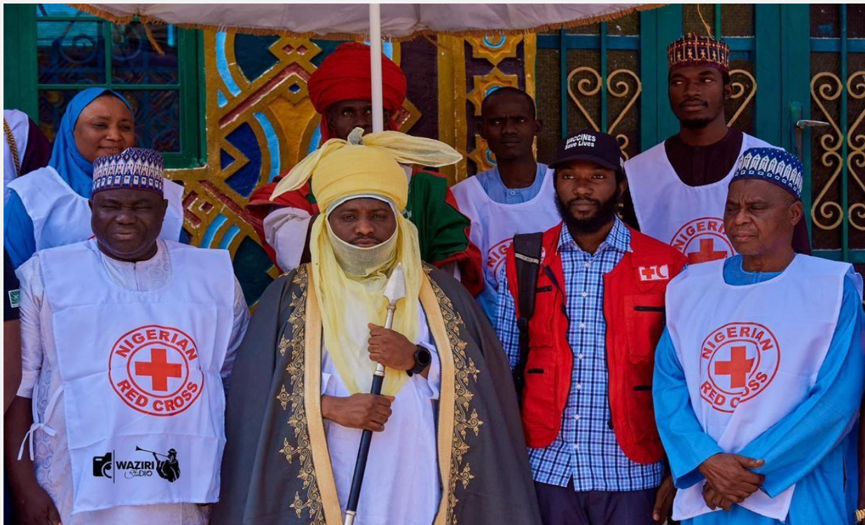
Nigerian Red Cross health team and volunteers engaging with a traditional ruler and community influencer, the Emir of Dutse, Jigawa during a Diphtheria advocacy