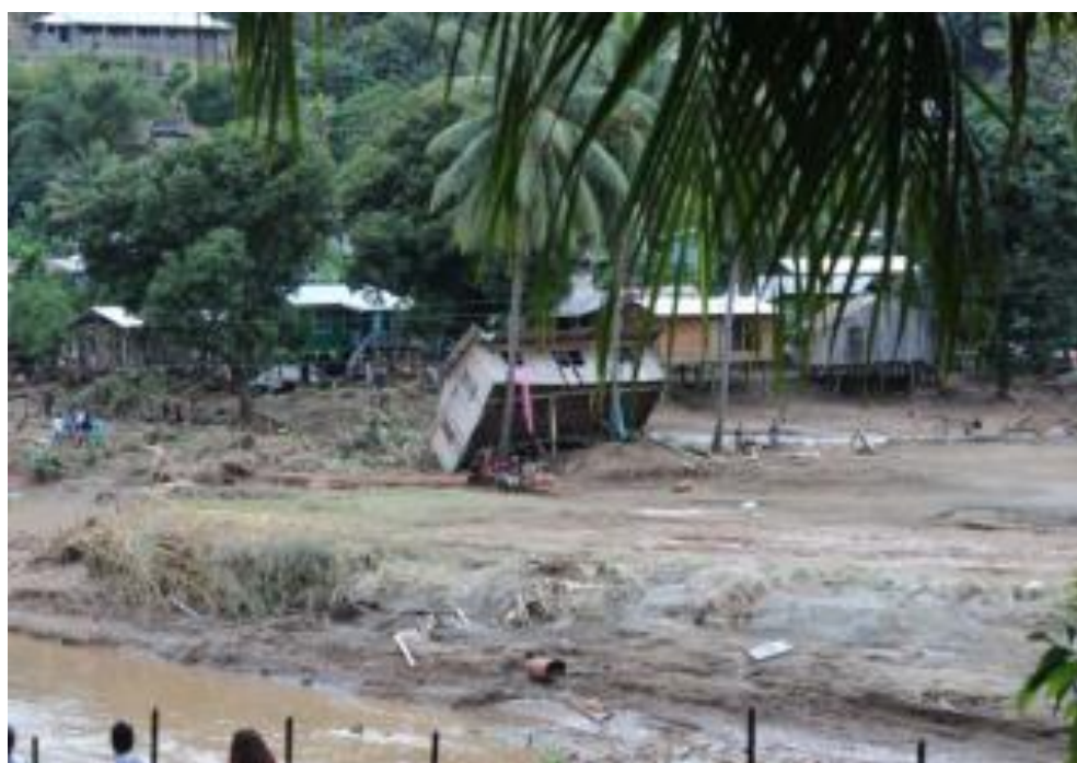
Koa Hill Community, Mataniko River Bank, Honiara, 5 April 2014.

The Solomon Islands Red Cross Society (SIRCS), with the support of the International Federation of Red Cross and Red Crescent Societies (IFRC) and Partner National Societies, undertook significant activities in addressing the most important humanitarian needs of flood-affected communities. These activities included registering people in evacuation centres, undertaking needs assessments, delivering water, sanitation and hygiene promotion activities (including producing and delivering safe drinking water) and distributing non-food items (NFIs) specifically household kits and emergency shelter kits. From the onset of the floods, it was readily observable and