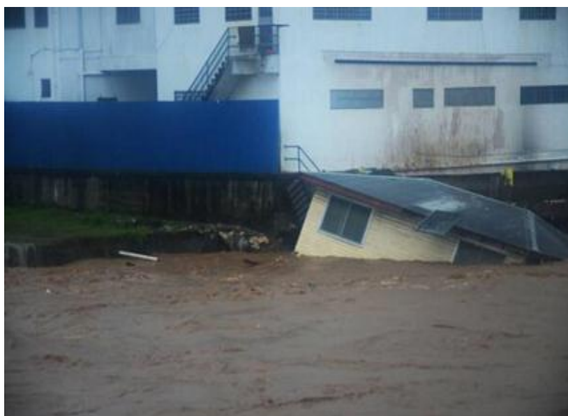
Flooding damage, Honiara, 5 April 2014.

Shelter 1 damage from the flooding was significant. Shelter was estimated to represent approximately 56 per cent of the total value in monetary damages. This was 2.5 times greater than the transport sector (the next most affected sector), 20 times greater than the combined health and education sectors, and 25 times greater than the water and sanitation