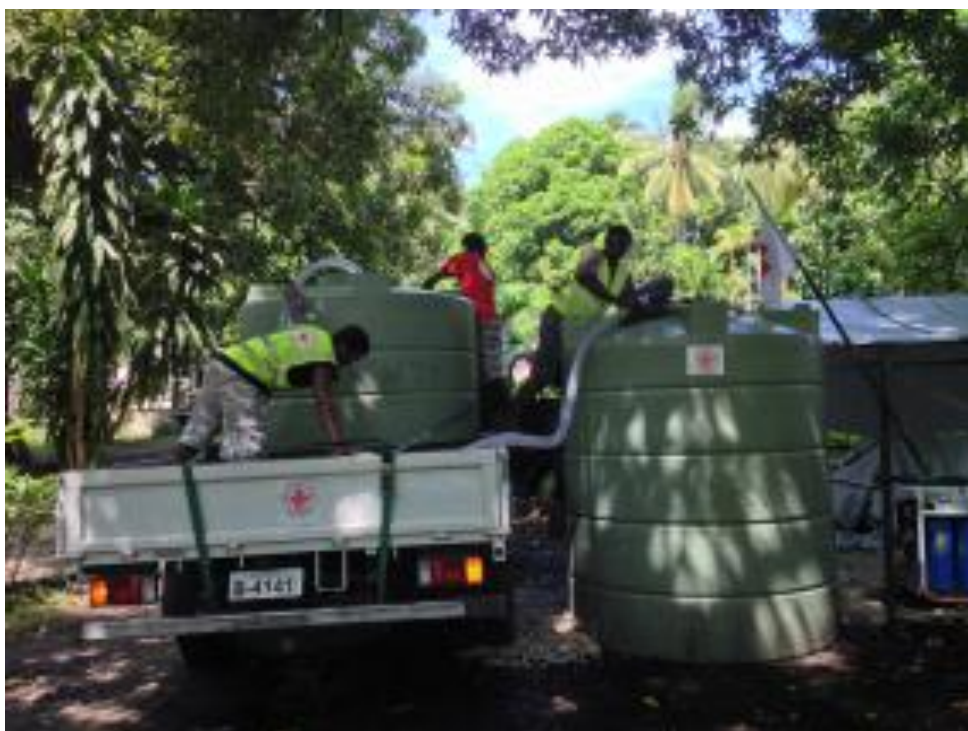
Water from a borehole in Tertere Correction facility is treated with a NOMAD water purification unit and delivered to communities in Guadalcanal plains, 2014.