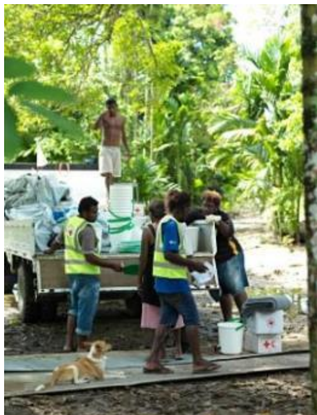
SIRCS delivers relief items to families in Guadalcanal, 2014.