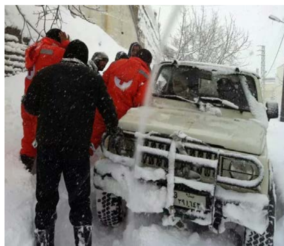
LRC volunteers rescuing people in mountain villages stranded by snow

On the 17 th of February and after one week from the second storm, a third snow storm hit Lebanon with. The LRC remobilized all its resources and was on high alert to respond to vulnerable people in the storm. The LRC gave support to 942 cases during 3 days, they mobilized 60 4x4 Jeeps and 40 ambulances to be able to respond to this storm.