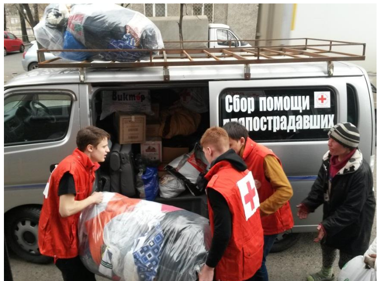
RRC volunteers providing a set of household items to a beneficiary in the fire-affected area by RRC volunteers.

The IFRC Regional Representation in Russia will support the Russian Red Cross technically and financially during the whole project, from the planning phase to the final reporting.