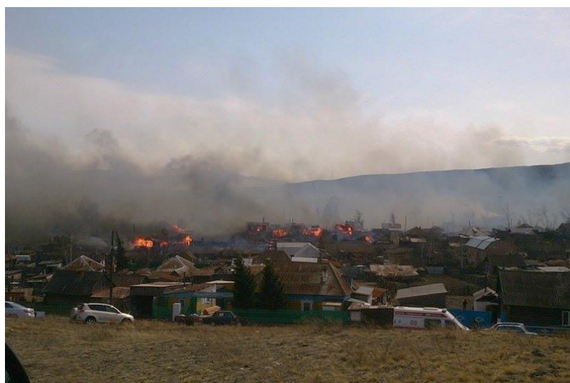
The forest fire reaching a settlement in the Republic of Khakassia, South Siberia, Russia.

The Russian EMERCOM and the local authorities evacuated more than 4,000 people who currently stay in 23 temporary shelters, and with relatives and host families. The local authorities and the EMERCOM mobilized more than 3,000 professionals, rescuers and anti-fire forces, which allowed to stop the spreading of fire on settlements. The rescues teams also managed to stabilize the situation. The federal government considers providing compensation of damage to the affected population and to build new houses to replace the destroyed ones by September 2015. Until this time, most of affected people will stay in temporary shelters.