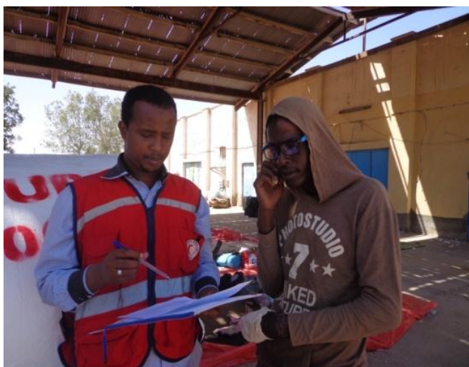
RFL officer assists arrival with tracing of relatives

From 1 April 2015, the SRCS has deployed staff and volunteers to the entry points at the ports; and reception centres, which have been established in Berbera and Bossaso, in order to provide arrivals / returnees with emergency health services (First Aid, vaccinations, nutritional screening etc.), pre-positioned basic Non-Food (NFIs) (blankets, buckets, jerry cans and kitchen sets as well as support the clean-up of the reception centres in readiness for inhabitation, and Restoration of Family Links (RFL) services. The SRCS has mobilized pre-positioned NFIs for 100 households (100 kitchen sets, 100 jerry cans, 200 blankets, 100 buckets); and First Aid materials from the existing Integrated Primary Health Care Programme to respond to the needs of the arrivals/returnees, which are now exhausted and will need to be replenished. Existing SRCS Mobile clinics are being used to evacuate sick arrivals/returnees to nearby hospitals; while mobile health staff and volunteers have also been re-deployed temporarily to the reception centres.