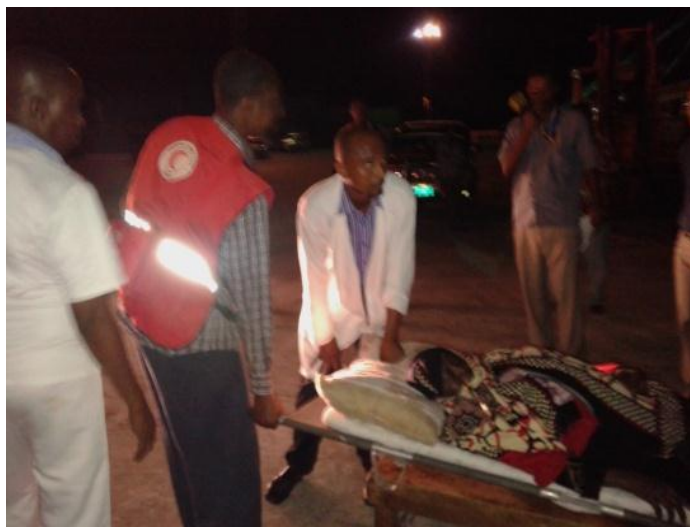
SRCS evacuate a new arrival to hospital immediately after arriving at Berbera port.