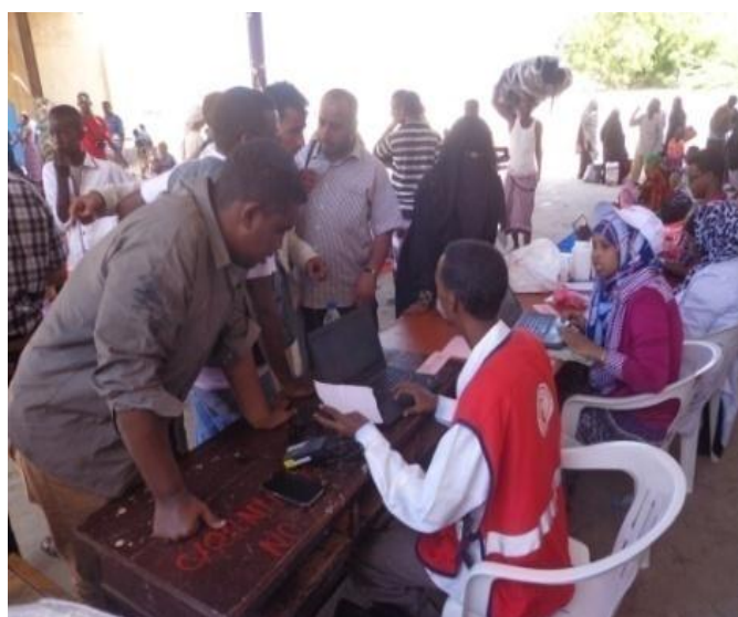
SRCS volunteers from Berbera branch supporting the registration of new arrivals

From 26 March 2015, there was an escalation in fighting between opposition groups in Yemen, which has affected an estimated 500,000 people, including 244,000 registered refugees (United Nations High Commissioner for Refugees (UNHCR)). As a result, Somali and Yemeni nationals affected by the crisis have begun to flee the country through the ports of Al Mukalla and Mukha in Yemen. On 28 March 2015, 32 Yemeni nationals reached the port of Berbera in Somaliland. According to Somaliland immigration authorities, the arrivals were from the Qahdani and Ibb tribes fleeing violence in Mukha, Taiz region, Yemen; and all has the relevant travel documentation. On 1 April 2015, 90 people reached the port of Bossaso (Puntland) comprising Somali returnees, originally from Puntland and South Central (Mogadishu, Kismayo, Qoryooleey etc.), claiming to fleeing violence against Somalis living in the Sana'a, Aden and Mukala areas of Yemen, and protection issues affecting women; as well as groups of Yemeni nationals.