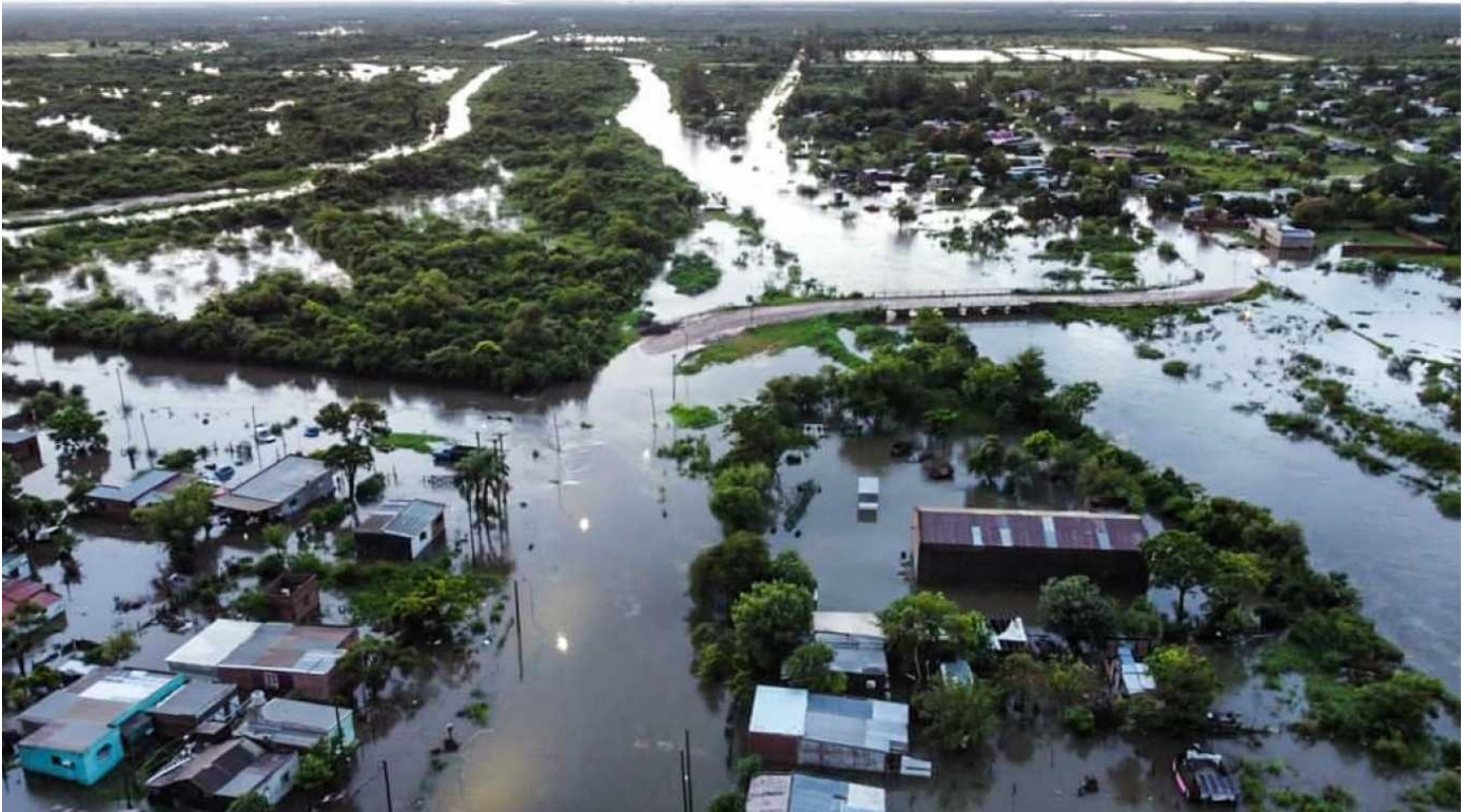
Aerial photograph depicting the aftermath of flooding in Corrientes City - March 2024.