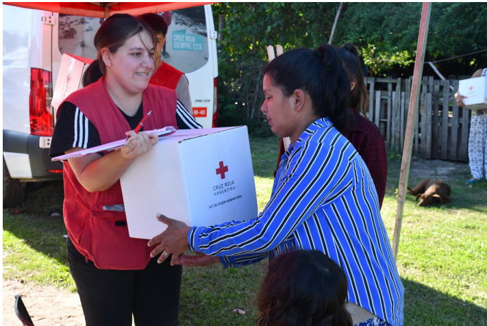
Delivery of Hygiene and Cleaning Kits - March 2024 - Corrientes - Source: Argentine Red Cross.

The Corrientes City Council will update the issuance of the declaration to establish a water and weather emergency in the city during the day on 13 March. This measure is taken to update the water emergency declared on 12 January 2024, recognizing the continuing challenges and changes in weather conditions affecting the city.