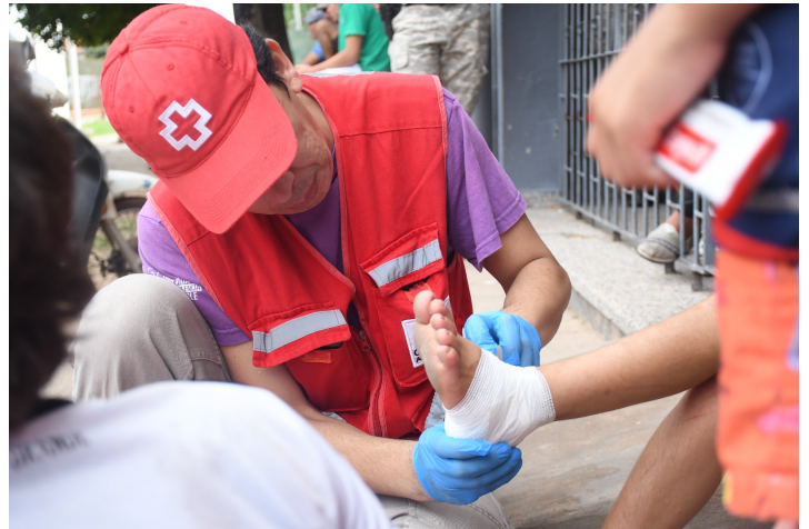
First aid assistance - March 2024 - Corrientes