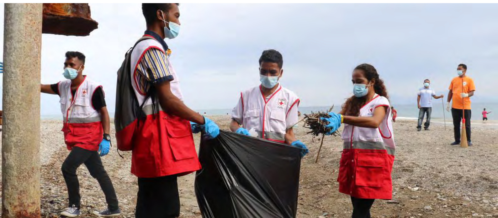
Timor Leste Red Cross Society volunteers conducting clean ups to help control the spread of dengue in January 2022.

Free and fair multi-party elections have been held regularly in Timor-Leste since 2001. No incidents of violence were recorded during the competitive national elections in 2017 and 2018, and there were fewer irregularities than in prior elections. The most recent presidential election was held in early 2022, with President José Manuel Ramos-Horta obtaining 64 per cent of the vote. This was followed by the parliamentary election in May 2023. This new governance has stated that it is vital for the international community to continue supporting the country's efforts to become more resilient to multiple shocks and to deliver the National Strategic Development Plan that is focusing on the human capital development area.