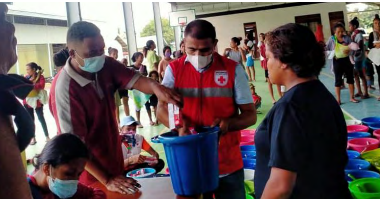
The National Society volunteers conducting providing family kits, baby kits and mosquito repellent families affected by February 2022 rains.

The Australian Red Cross is supporting the National Society in PMER, IT and data management.