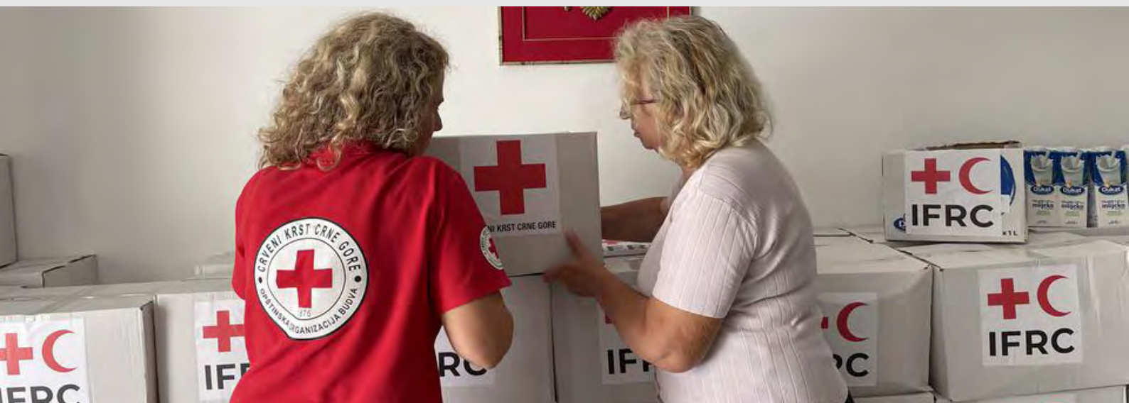
The Red Cross of Montenegro continues supporting migrants from Ukraine with the distribution of essential household items, hygiene kits and school kits.