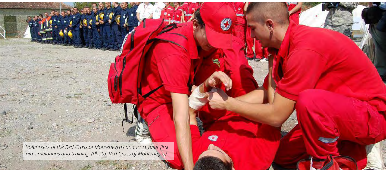
Volunteers of the Red Cross of Montenegro conduct regular first aid simulations and training.

With the support of IFRC, the Red Cross of Montenegro has been implementing activities through projects that are focused on route-based migration . The Red Cross of Montenegro has a mobile team in the transit camp in Bozaj, which provides medical services, transport, translation, and humanitarian assistance to migrants. Three humanitarian service points have been established with the support of IFRC.