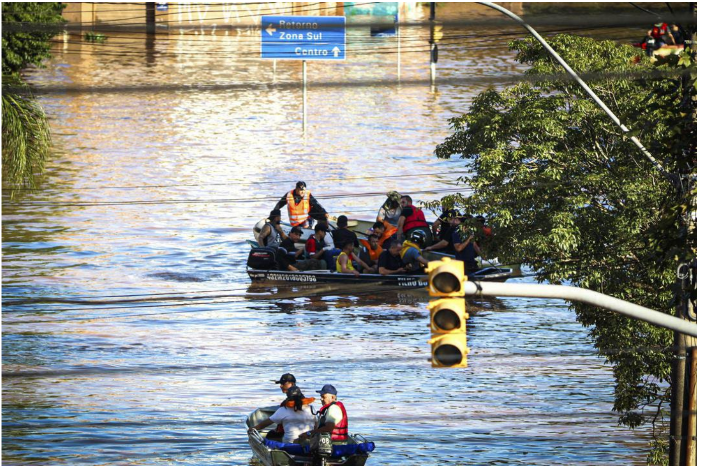
Rescue actions in Brazil, Rio Grande do Sul. Residents are rescued by militaries and volunteers from houses flooded by the waters of Guaiba Lake in Porto Alegre after the torrential storms hit the state of Rio Grande do Sul, southern Brazil. May 7, 2024.