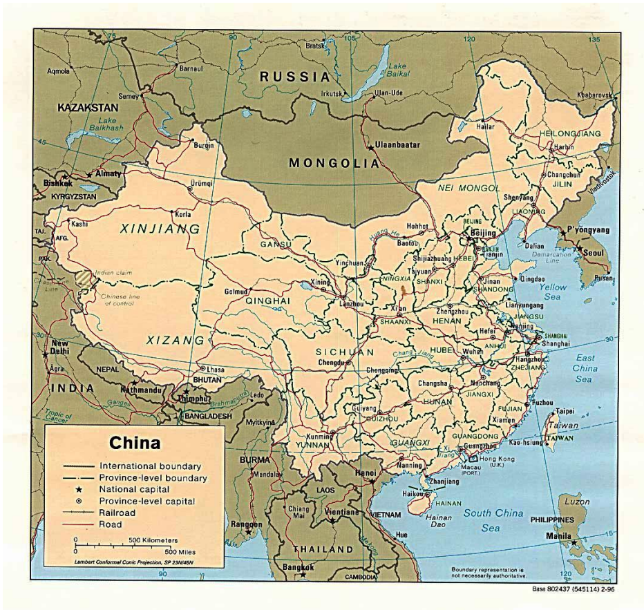
Map of China