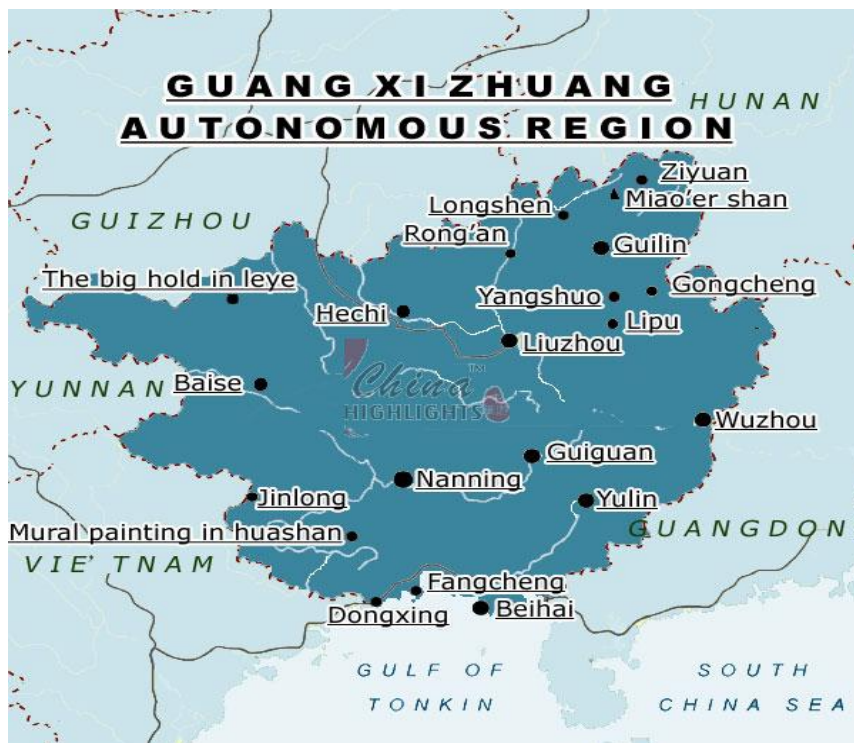
Map of Guangxi