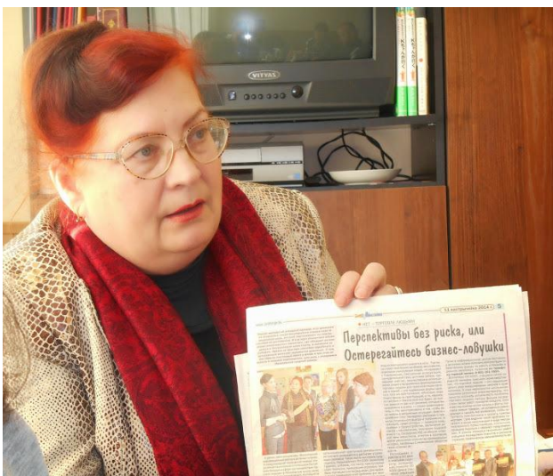
Newspaper article on project activities at Red Cross regional branch in Vitebsk

Project activities have been monitored effectively. The monitoring of project activities followed standard IFRC reporting procedures. At the local level, activities and financial expenditure were monitored by Red Cross branches (project and financial coordinator), who reported monthly to the Belarus RC Headquarters in Minsk and by Belarus RC Headquarters to IFRC office in Belarus. All activities were well documented. Capturing national media attention has turned out to be somewhat challenging, but information about the project activities was well disseminated in various local media reports. 10