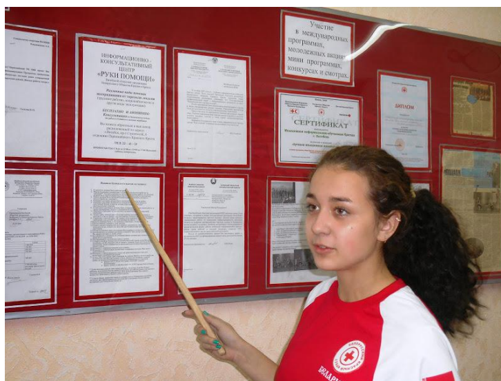
Red Cross Museum at a local school in Vitebsk.

The project implementation generally faced no significant unforeseen challenges. A couple of minor difficulties have emerged but they did not threaten the overall realisation of the project's objectives. As already mentioned earlier, fine tuning of the project was difficult at the beginning of the project implementation period. Compensating the relative of delay of activities in time and financial expenditure, extending the project implementation period with a couple of further months might be necessary.