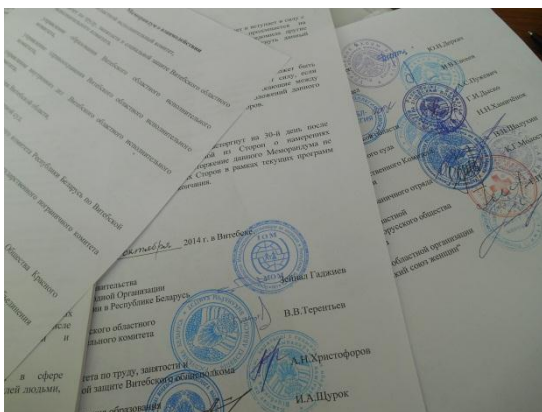
Photo of the new signed MoU in Vitebsk with partners.

Information about re-integration assistance organised within the Helping Hands Centres is regularly provided by the police, Ministry of Interior and Executive Committee. The Labour Committee itself is involved in the re-integration assistance by providing vocational trainings for former victims. Re-integration assistance provided by the Belarus RC is also important for the Police during investigation and prosecution procedures of traffickers. Since former victims are re-traumatized every time they need to talk about their previous experiences, psychosocial support provided by the Helping Hands Centres is necessary to ensure former victims' emotional security during court procedures. Cooperation with a number of non-state actors in awareness-raising activities has largely developed after organising competitions for community-based initiatives to support. Overall, the general perception of external actors is that the Red Cross is essential in addressing trafficking in human beings in Belarus, both in prevention, assistance and during prosecution procedure.