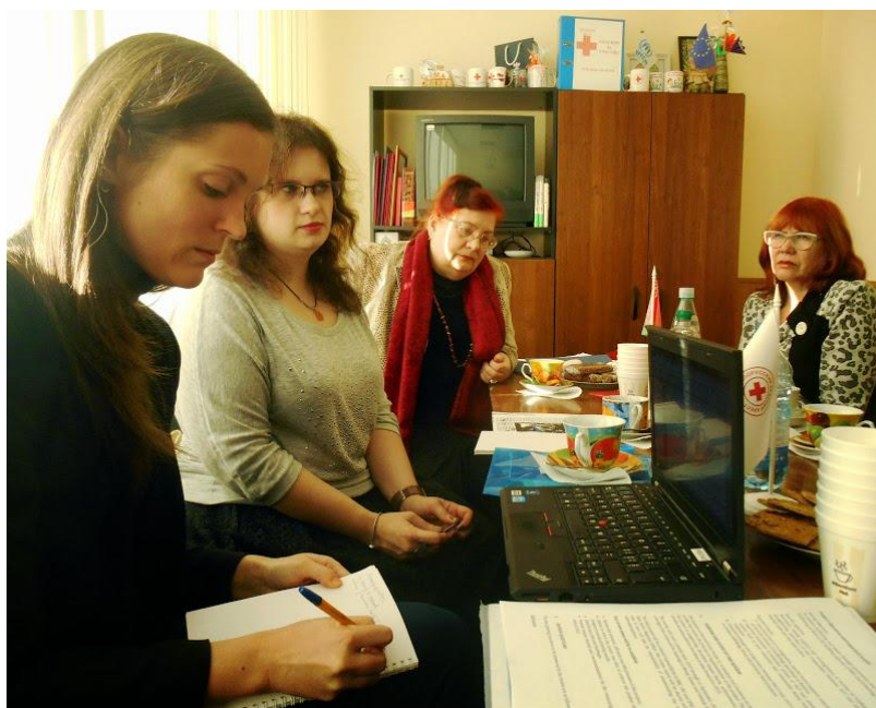
Mid-term review session at the Red Cross regional branch in Vitebsk.

The current project is the continuation of a previous successful cooperation between the Belarus RC and the Icelandic Red Cross (IRC). The previous project under the title 'Youth volunteering to prevent trafficking in human beings' started in 2011 and concentrated on combating human trafficking in Gomel region. It aimed at enhancing cooperation between state authorities, the Red Cross and partner NGOs, on re-integration activities and the improved awareness of potential victims. After three years of implementation, it was completed in May 2013 with great success in Gomel region. It efficiently managed to strengthen cooperation between project partners and resulted in the continuation of the project cycle for another three years.