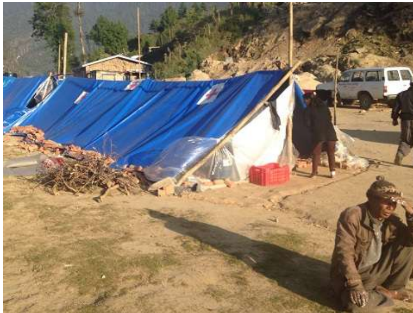
One of the site where emergency shelters provided by NRCS were set up .

vehicles blocked at the airport awaiting clearance. The logistics team continues doing slot management at the airport to clear the cargoes. Any Movement partner planning to send air cargoes are requested to coordinate through the coordination of the KL-ZLU to secure landing permits and landing slots and to avoid last minutes clearance issues. Similarly, for road transports arriving in Nepal should be coordinated through the ZLU and to enter only through the Birgunj border where teams are ready to support entrance.