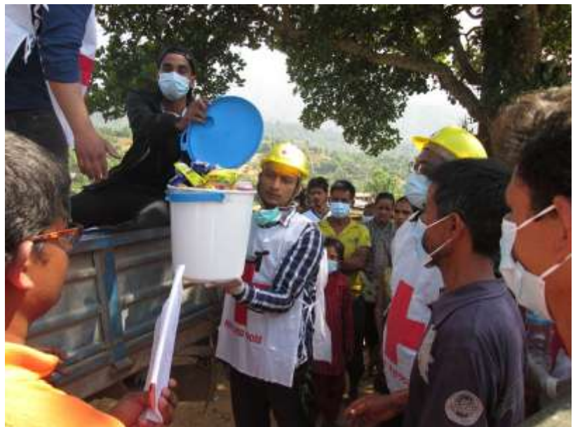
Volunteers distributing the ready-to-eat food items to the affected people in one of the community.