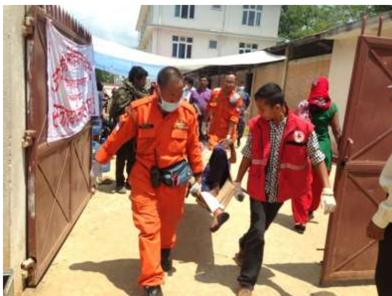
NRCS volunteers mobilized to support search and rescue and safe transfer of injured person.

The overall situation in affected areas is improving and dependent on military and health care support from foreign countries continued to decline. Most of the countries have withdrawn their health team from Nepal. The top priority remains delivery of shelter, water, sanitation and hygiene promotion (WASH), non-food items (NFIs) and food. Relief distribution by national and international agencies have increased through all affected districts; however some remote areas in Dolakha and Solukhumbu district are still in need of relief items.