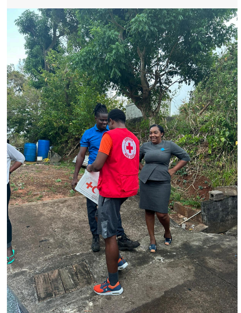
Distribution of Jerry Cans by GRCS volunteers.