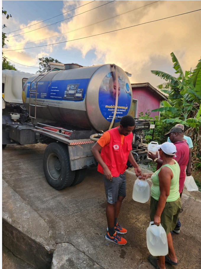
Volunteers from the GRCS distributing jerry cans in the community of Willis. NAWASA's water truck was on scene to fill the jerry cans with treated water.