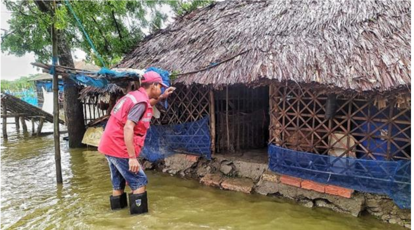
One of the BDRCS volunteers, going door to door to assess the household situation and needs of the affected people.