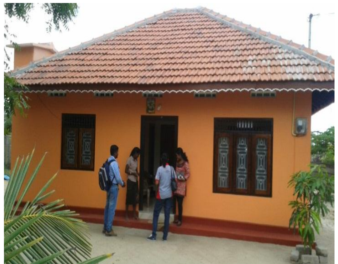
A monitoring visit to a fully completed house in Ariyalei Southeast, Jaffna, Photo Cred: IFRC