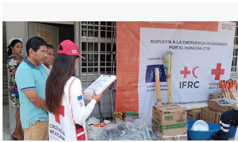
Community cleaning tools distribution.