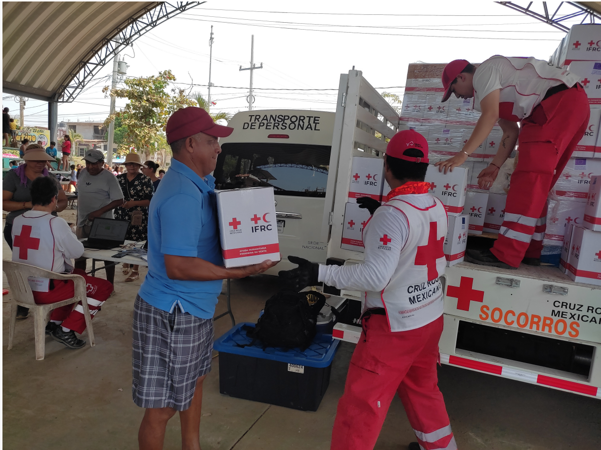
Volunteers from Mexican Red Cross distributing kits to people affected by Hurricane Otis.