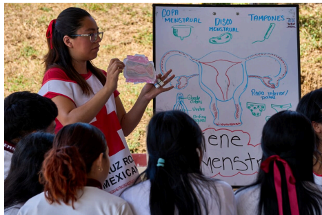
Menstrual Hygiene Educational Session.