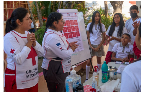
Hygiene Promotion Session.