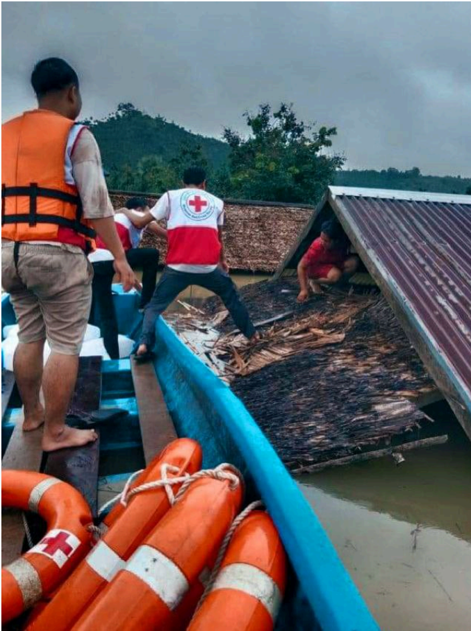
Red Cross Volunteers evacuating flood-affected communities to safe place in Tanintharyi Region, 30 July 2024

Due to ongoing monsoon rains, widespread flooding continues to be reported at different locations along the main rivers, affecting the Ayeyarwady delta, Rakhine, Mon, Tanintharyi coastal areas, and regions including Yangon and Bago. This situation is exacerbated by Typhoon Gaemi, which struck Taiwan with wind speeds of 127 mph on 25 July. The residual clouds from the typhoon moved towards Myanmar, Thailand, and China, potentially generating further flooding and heavy rainfall in these regions.