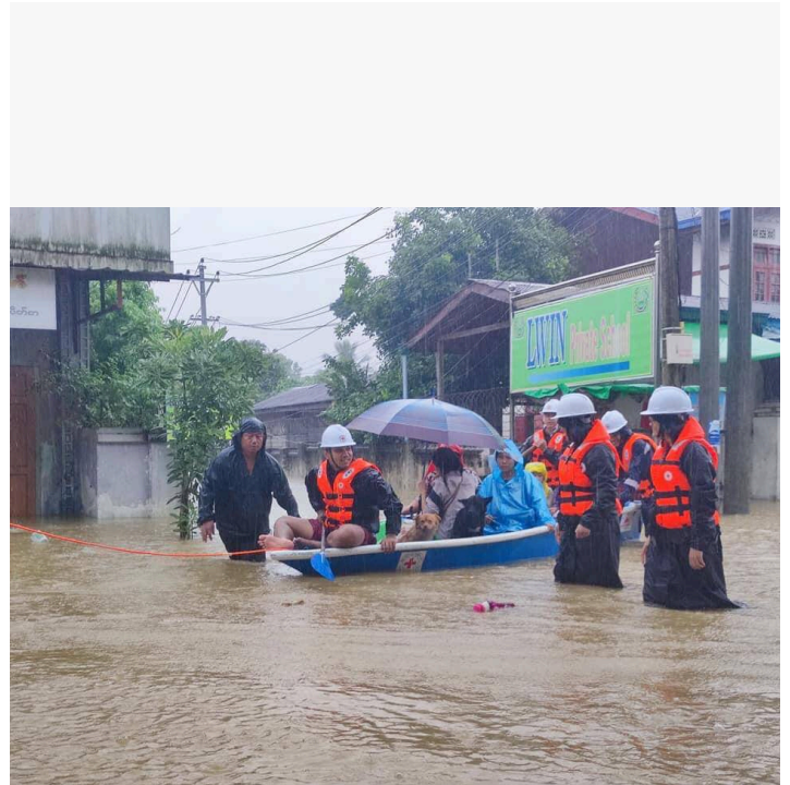
Red Cross Volunteers evacuating flood-affected communities to safe place in Myintkyina, Kachin State, 1 July 2024