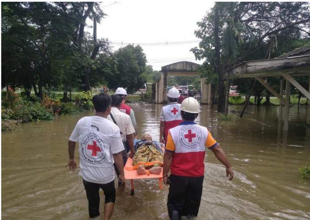
Red Cross Volunteers support the search and rescue and evacuation process for affected community in Bago region