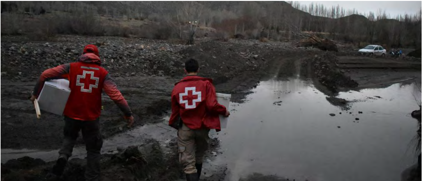
The Argentine Red Cross supported the affected communities of Chos Malal, Vista Alegre and Centenario who were affected by rain-induced flooding, 11 July 2023.

The IFRC as a result of the aforementioned discussion, is part of the technical working group of the 'V Global Mental Health Summit'. It has secured the participation of some National Societies at the Summit. In addition, the Humanitarian Observatory will present reports on mental health carried out in several countries.