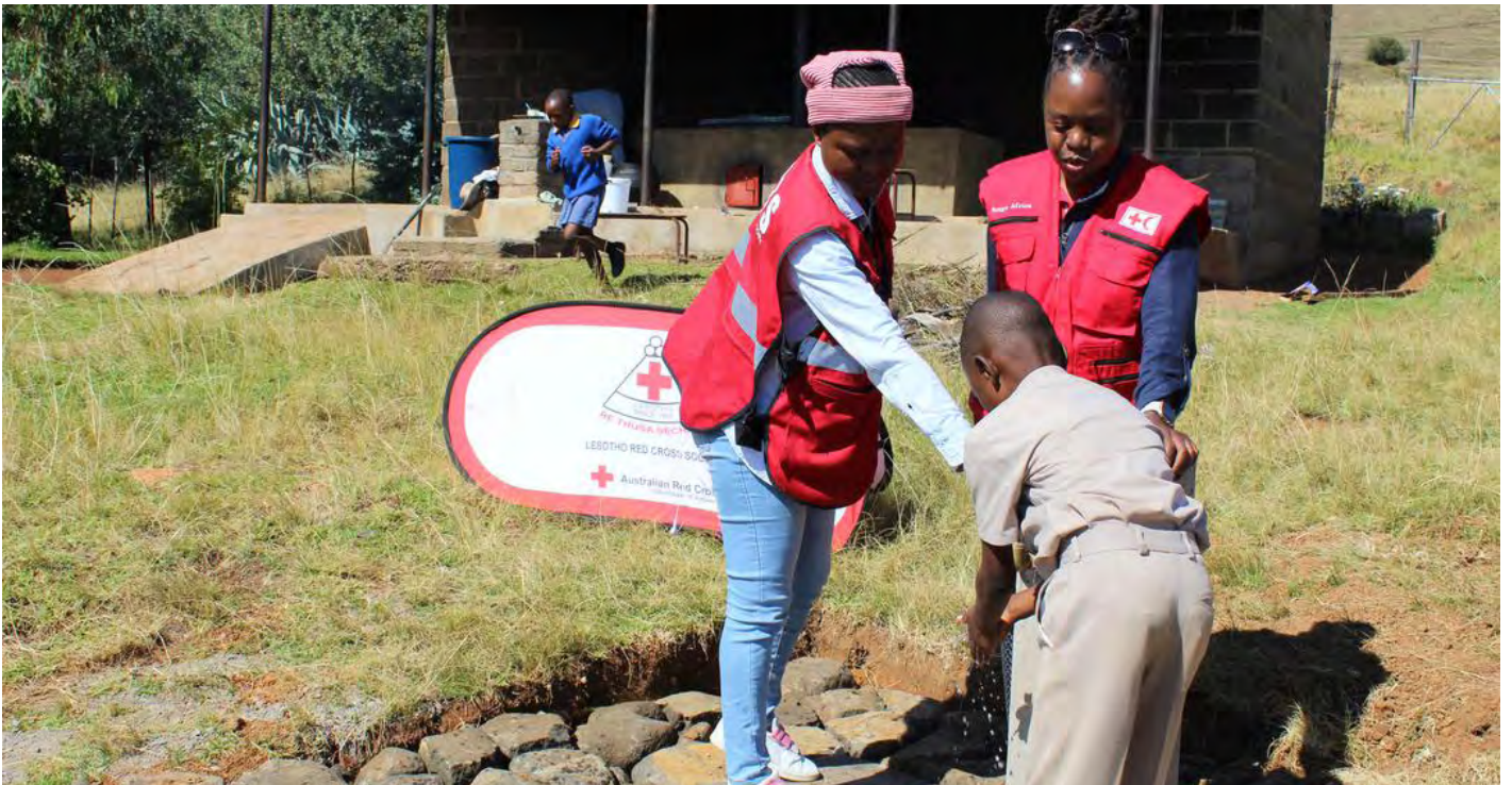
The school feeding project in Lesotho gave children a chance to actively engage with gardening to strengthen the response to climate change.

The IFRC country cluster delegation in Pretoria, South Africa, ensured that the National Society staff and volunteers have the knowledge, capacity and resources to serve as agents of change as well as mobilize urgent action to adapt to climate and environmental crises.