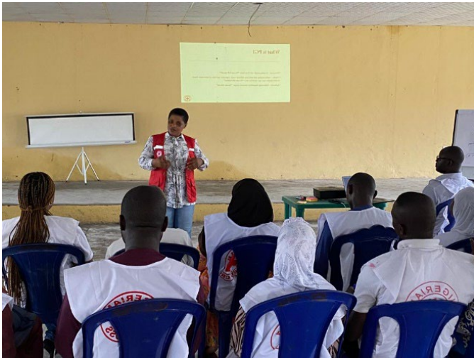
Training of Volunteers in Nasarawa State, Nigeria.