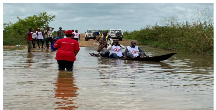
NRCS team at river site with community members during floods simulation in Nasarawa state.