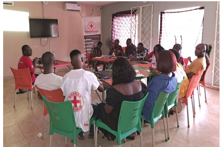
Training of Volunteers in Edo State, Nigeria.