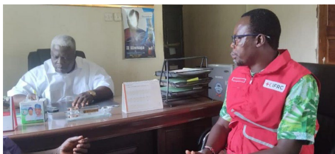
IFRC senior DM officer explaining the objectives of the SEAP project, and soliciting the support of the director of SEMA, in Nasarawa state.