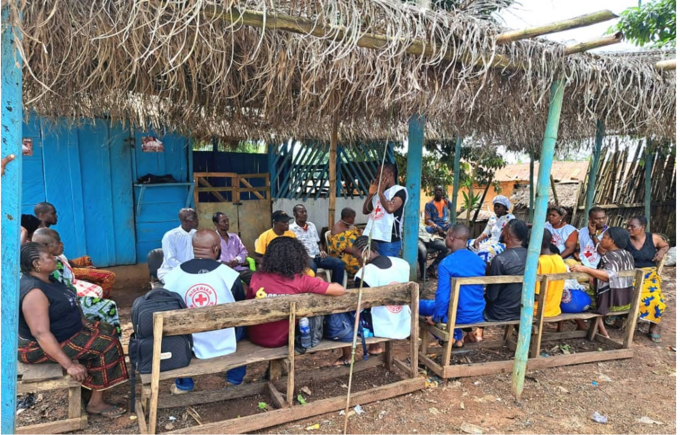
Community consultative meeting on preparedness between the Nigerian Red Cross Society (NRCS) and some community representatives in Edo state, Nigeria.