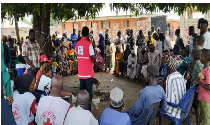
Community consultative meeting at Doma LGA, Nasarawa State.