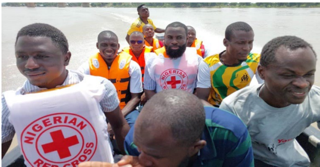
NRCS volunteers and community members in a boat during floods simulation in Adamawa state.