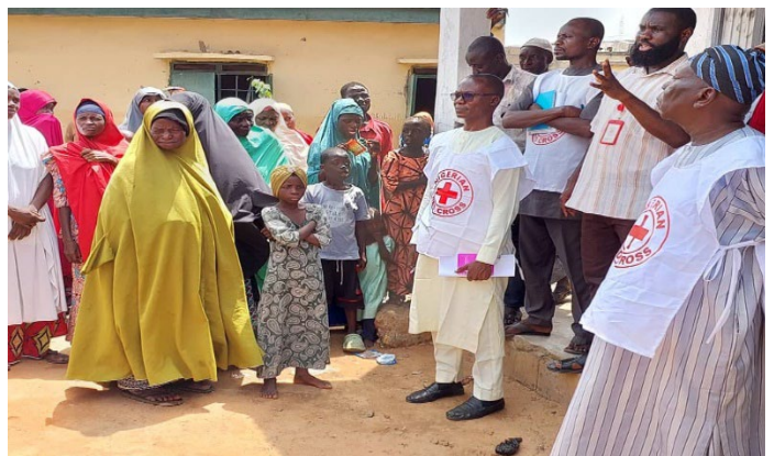
Community entry and meeting at Boronji Community, Adamawa State.