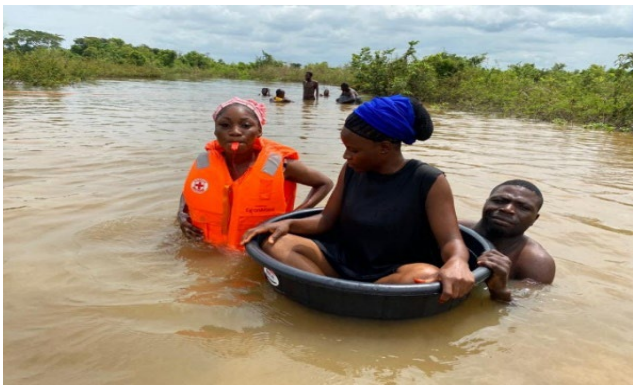
Training community people on the use of local resources for floods emergencies.