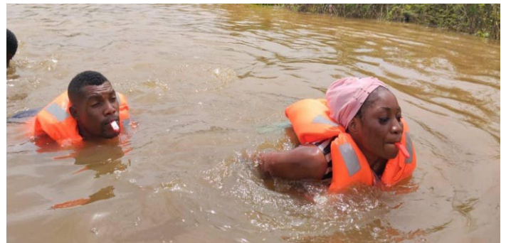
Community members practicing the use of a life jacket for rescue during floods simulation in Nasarawa state.