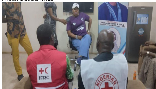
NRCS/IFRC team during a courtesy visit to the Nasarawa state commissioner for special duties and humanitarian affairs.