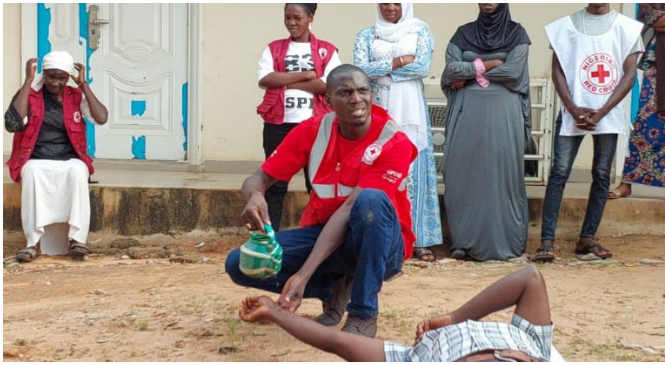
Floods rescue tactics during a community sensitization in Adamawa state.