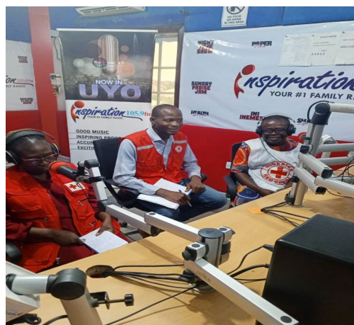
NRCS Akwa ibom state branch in an awareness creation session with media on sEAP implementation in the state.