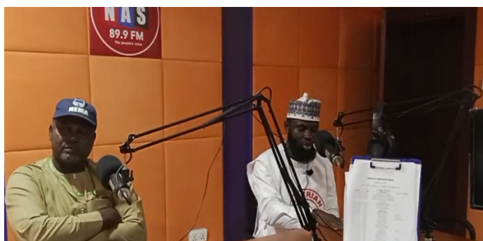
NRCS Adamawa state branch secretary during a media chat on sEAP implementation in the state.