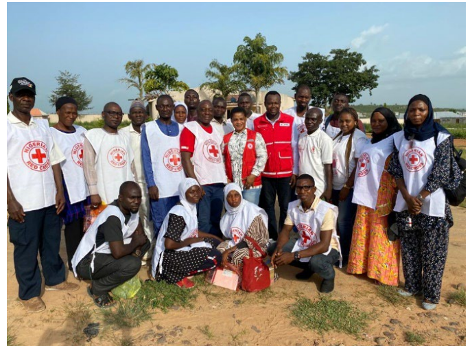
Cross Section of sEAP training participants in Nasarawa State, Nigeria.