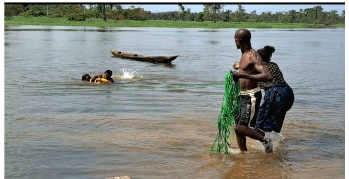
NRCS team at simulation site with community members in Edo state.