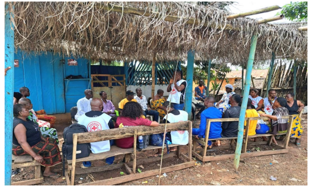
Community consultative meeting with Siluko, Ogbuma, and Okwa community representatives in Benin, Edo state.