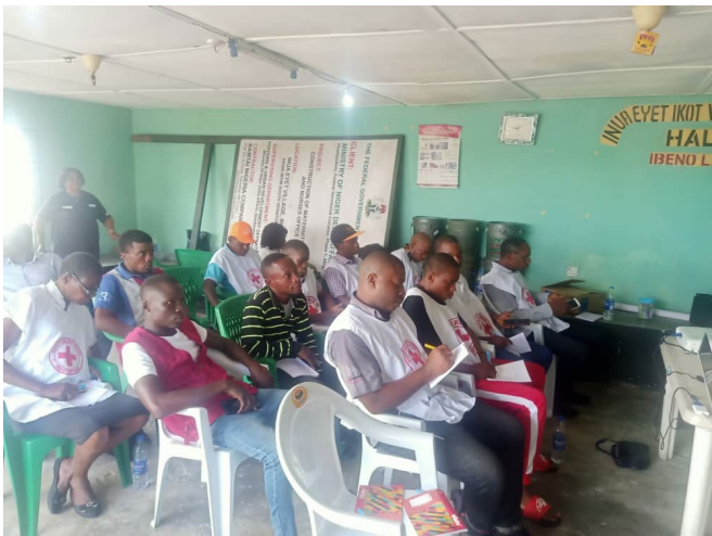
Training of Volunteers in Akwa Ibom State, Nigeria.