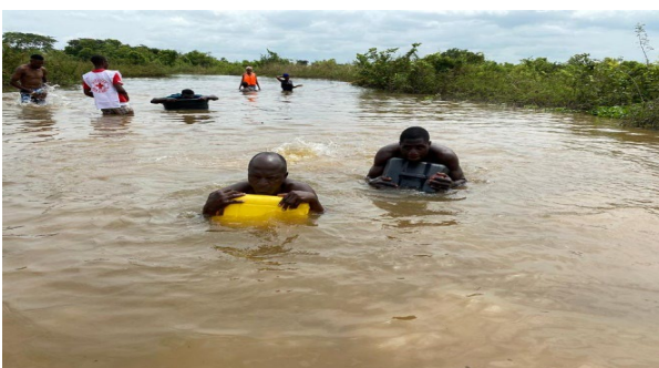
Community members during simulation in Nasarawa state. Using local materials for flood emergency rescue.