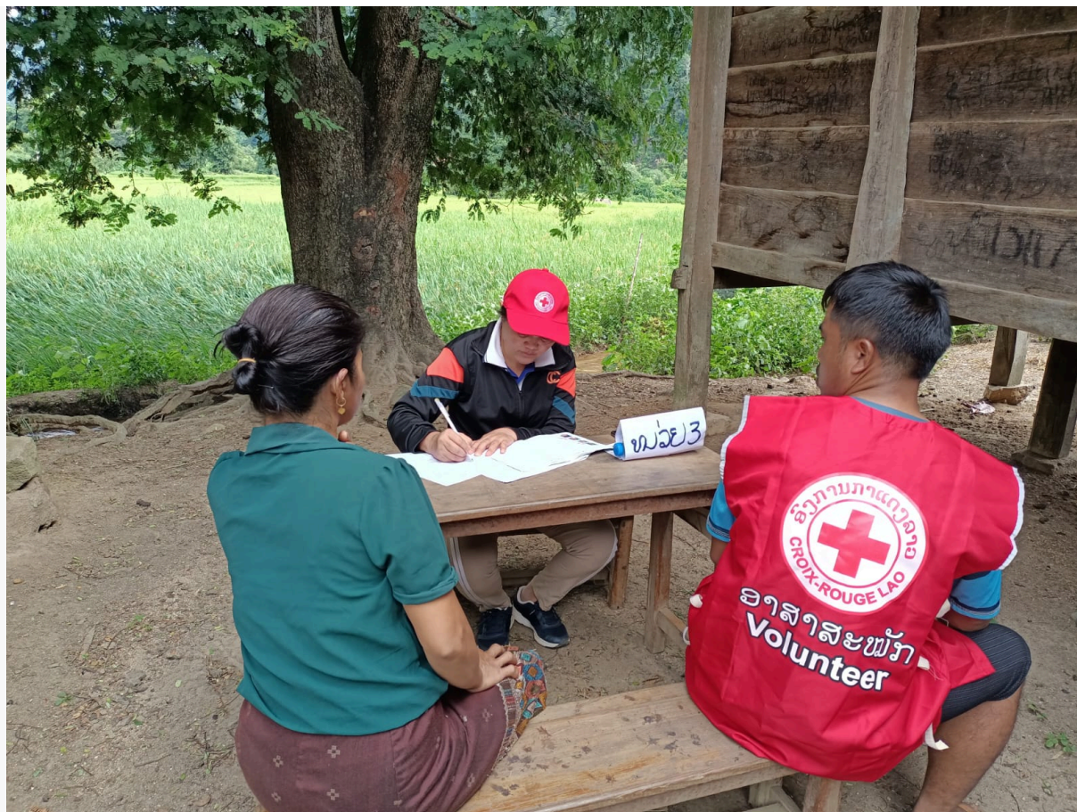
LRC staff conducting needs assessment through an interview with one of the affected people at Yuak Moun Villages, Mork District, Xiangkhuang Province.