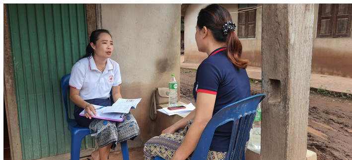
Needs assessment by LRC staff at NarOne village, Xienghorn District, Xayabouly Province.