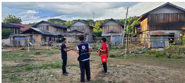
Needs assessment at PangHai Village, Khob District, Xayabouly Province.

During late August 2024, the available information was inadequate for LRC to formulate a comprehensive plan of action and outline activities for each sector. Therefore, LRC applied for an IFRC-DREF assessment to evaluate the situation of the affected households and identify appropriate assistance in the most affected areas.