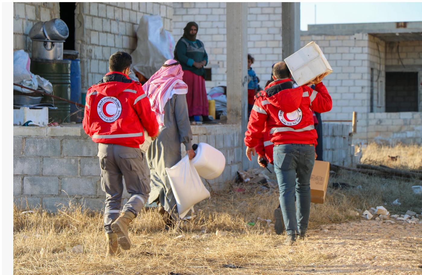
Complex Emergency 1