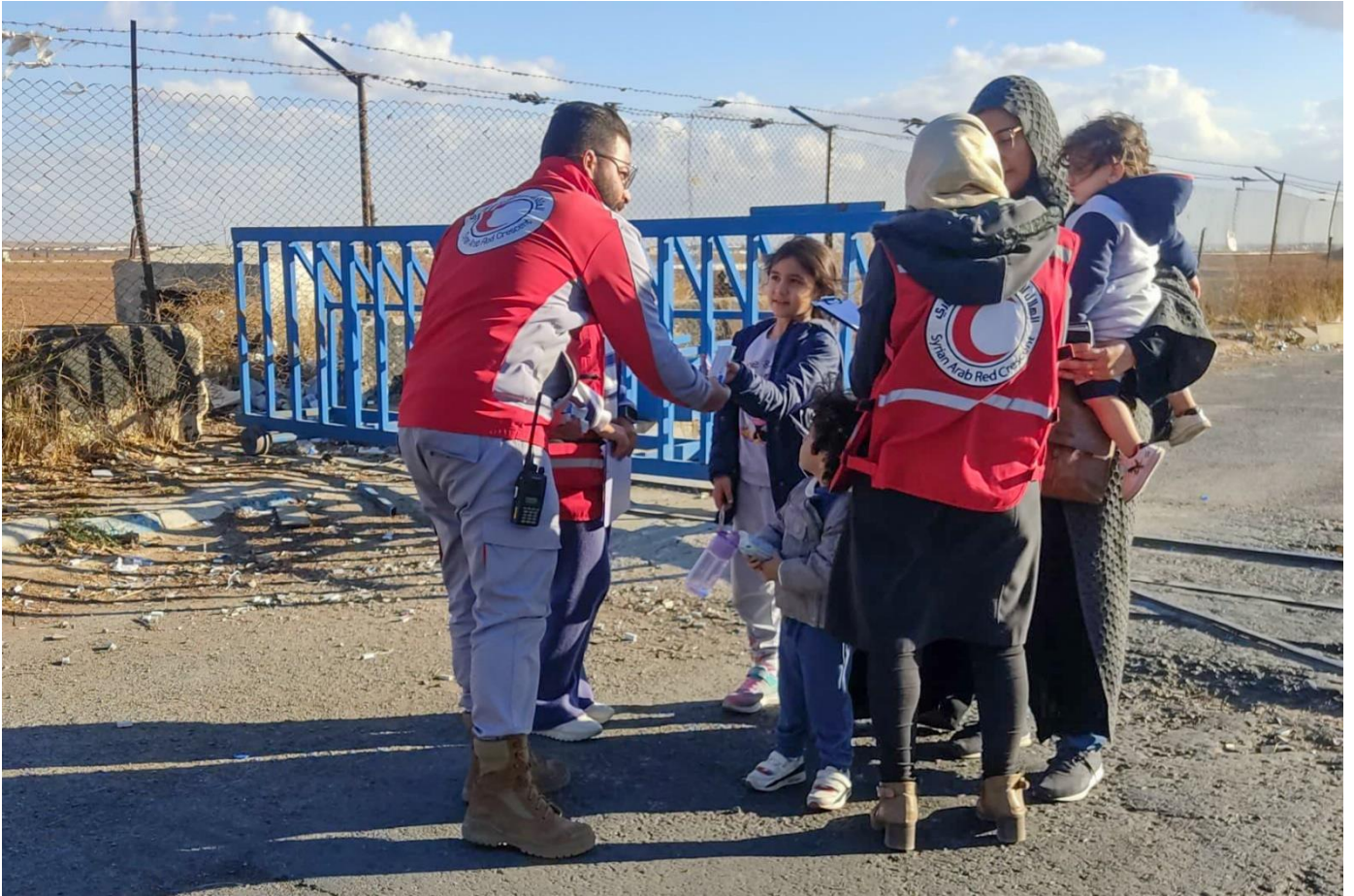
At Syrian border crossings, volunteers from Syrian Arab Red Crescent (SARC) are providing essential consultations and information to Syrians returning.