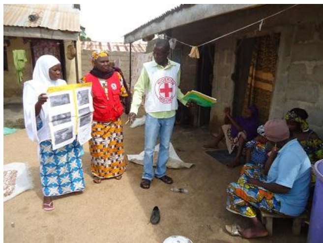
NRCS volunteers during the community sensitization in Adamawa State

The insurgency has developed new tactics and approaches. There are increased suicide bombings mostly carried out by women, girls and children targeting crowded places including markets and places of worship. On average