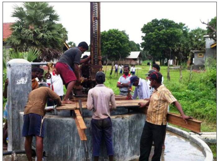
Renovation of a community well at Peraru, Mulathivu

April 2010: Launched for CHF 3.6 million on a preliminary basis to support 5,000 families of internally displaced persons (IDPs) in Sri Lanka for 24 months through the Sri Lanka Red Cross Society (SLRCS).