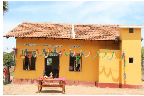
A completed and decorated house for its opening in Kovikulam, MW-Manna.

The Indian Housing Project (IHP), the component with Gol funds is the main ongoing housing element at the moment. The housing, with the support of Red Cross and Red Crescent Movement funds is completed at present, except some 50 houses bilaterally with Taiwan Red Cross Organization.