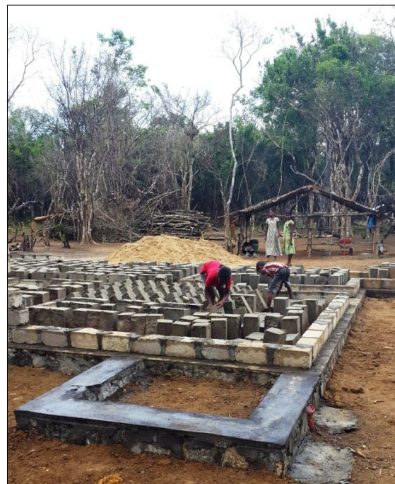
Construction of 28 houses ongoing in Poomalanthan Village in Mannar