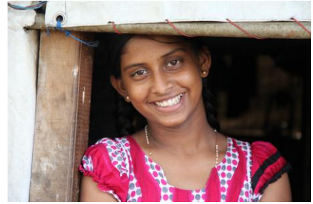
Bringing smiles with the hope of a new house and livelihood – Nachchikudah Killinochchi.

The new provision of school and communal water and sanitation projects commenced in 2014 in four districts; in 17 DS divisions; in selected most vulnerable GN divisions from each DS division selected under Indian Housing Project. As a result of the 17 integrated community assessments conducted in those selected GN divisions to identify the needs, 38 projects were identified to improve water and sanitation facilities of those villages and ongoing at present. Out of those 38 projects, 27 projects are implemented to improve drinking and utility water supply and the rest of the 11 projects are to improve sanitation facilities of the communities. Hygiene promotion activities are also ongoing in line with the hardware activities. Total number of beneficiaries reached at present through completed activities is 4,364 (direct: 2,130, indirect: 2,234).