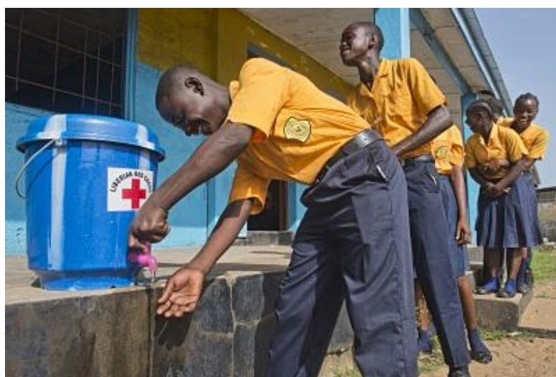
Schoolchildren at WLP Brumksine Methodist Elementary and High School in Buchanan, Liberia wash their hands before entering class. Schools throughout Liberia were closed during the Ebola epidemic but have recently reopened after almost a year due to a sharp fall in the number of reported Ebola cases. The Liberian Red Cross is urging continued vigilance and good hygienic practices to prevent a resurgence of the viral disease that has killed thousands of people in Liberia.

Six emergency appeals were launched to combat Ebola Virus Disease (EVD) outbreaks in Guinea, Liberia, Sierra Leone, Nigeria and Senegal, while providing coordination and technical support at the regional and global level.