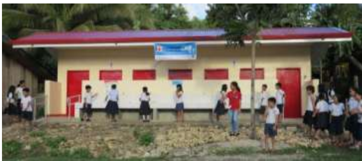
Sto. Niño dela Paz Elementary School, Loon, Bohol is one of the ten schools provided by PRC with water and sanitation facilities, giving students, teachers as well as communities, an access to sanitation facilities.

PRC provided bladders and tanks, facilitating the distribution of 3.1 million litres of water, benefiting 60,000 families. In addition, some 10,000 households were provided with jerry cans. These interventions improved the affected communities' access to safe drinking water thereby contributing to reducing the risk of water-borne and water related diseases in the communities.