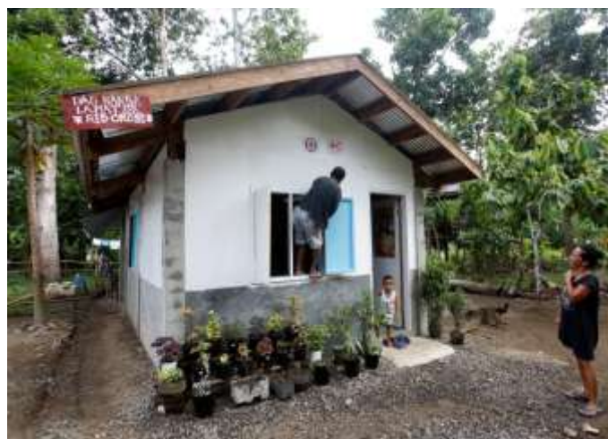
Brigida and Samuel Halawig in Calape, Bohol, one of many who lost their homes, have now gained much needed protection against the element through the provision of a shelter.

Building community resilience contributes towards mitigating risks in the event of disaster. Comprehensive orientation and awareness-raising sessions on building back better principles were organized prior to provision of shelter materials and assistance. Sessions were also complemented with information, education and communication (IEC) materials, such as flyers, with text in the local dialect. Message on building back safer also reached communities through installation of tarpaulins in different barangays.