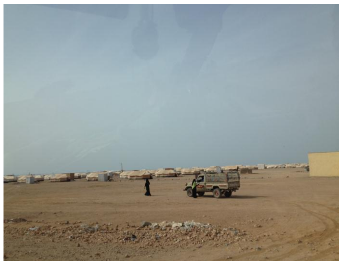
Figure 4: Markasi Camp 4km from Obock

Markasi Refugee Camp (4km from Obock): Markasi site was the site chosen by the government for refugees. No prior infrastructure was built on this site and a refugee camp had to be built from a desert field. On 19 April 2015, UNHCR and the Norwegian Refugee Council (NRC) began construction on this site to prepare it for refugees. On 10 May 2015, the Djiboutian government stated Markasi would be the sole site for Yemenites claiming refugee status and the United Nations were able to put forth a contingency plan for coordinated activities and funding. At the time of this report, the camp was not fenced and limited services were being provided. Primary actors in the camp included: