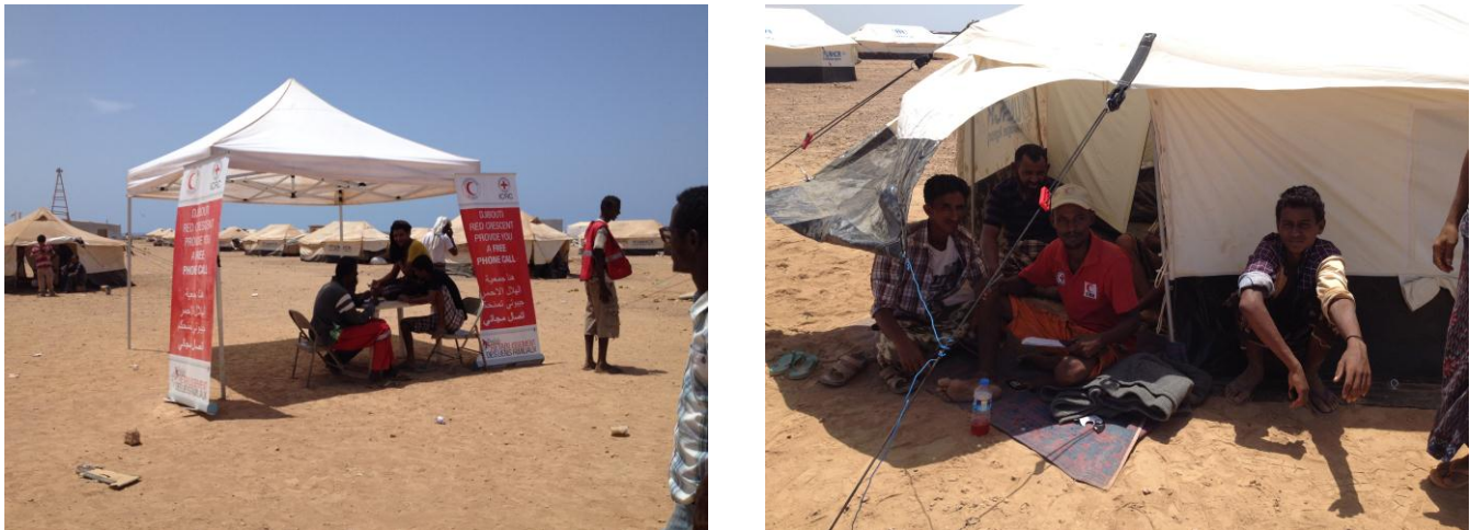
Figure 3: Current mobilized volunteer providing services at Markasi Camp

The DRCS is currently holding three crisis meetings a week to share information internally and ensure that programs are coordinated and challenges to unrolling activities are addressed. These meetings are also open to movement partners for observation. The DRCS has long been coordinating programming with the Djiboutian Government, the UN and non-government organisations (NGOs) in the areas of disaster management, health, water, sanitation and first aid – and these relationships are being drawn to assist their response to the current crisis, as well as continued to communicate regularly with all other organizations operating in the area, including the port authorities of Djibouti.