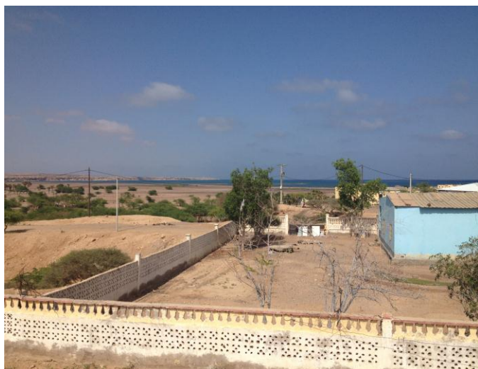
Figure 3: The town of Obock, Djibouti

B) Obock Port & Transition: The second point of entry is in the port town of Obock, in the northeast area of Djibouti. Boats coming from Yemen, passing Obock are flagged by coast guard and requested to dock, letting off those claiming asylum. UNHCR meets arrivals at the port for registration and provides protection services. Volunteers from the DRCS are on standby to provide first aid support and restoring family links services. From the port, refugees are brought to UNHCR for registration and then brought to Markasi camp.