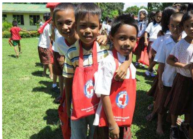
Students in Cahayag Elementary School, Tubigon lining up to receive the hygiene kits provided by PRC. These distributions constituted part of the CHAST approach to help students in good hygiene practices to prevent diseases.

During the baseline, 65 per cent of the respondents had indicated that they washed their hands in order to prevent germs and hygiene-related diseases; the percentage increase to 88 during the end line. An increase in the level of awareness on the cause of diseases, especially diarrhoea was also noted, with an increased from 68 percent during baseline to 85 per cent at end line. Results indicated behavioural change among families after attending PHAST activities. The level of awareness and practice on proper hygiene significantly improved.