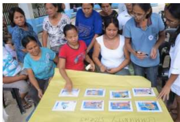
Hygiene promotion through PHAST approach was done in Tubigon, Bohol. This activity changed behavior practice among locals on how to maintain proper hygiene.