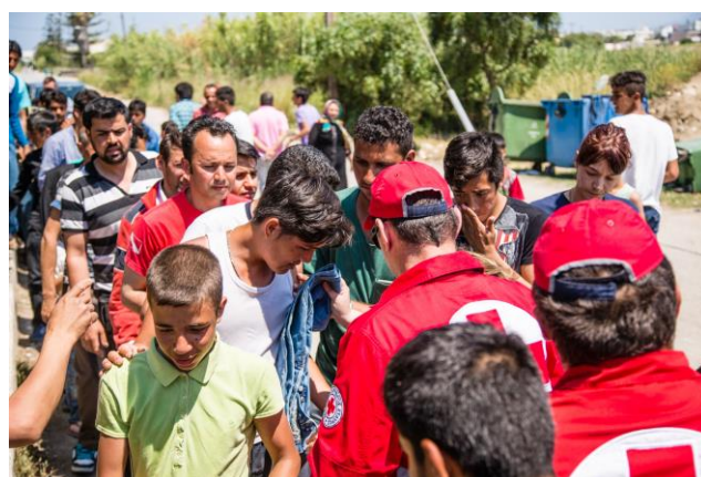
Hellenic Red Cross volunteers distributing non-food relief items to migrants staying at a temporary accommodation on Kos, Greece. There are over 300 people residing in this abandoned hotel at present.

This operation update is being compiled to provide a short, timely reflection on the situation in Greece and the response to the migrant crisis, which is affecting a number of the island communities. There is no major change to the operation at this point, and the update provides information on the current situation and details available at this point in time. The DREF operation has been launched as planned, and it is being implemented in line with the Emergency Plan of Action. The Hellenic Red Cross (HRC), with the support of the Secretariat of the International Federation of Red Cross and Red Crescent Societies (IFRC), is working to deliver assistance to the migrants and the affected communities supported with a DREF allocation of CHF 296,549 released on 22 May 2015. The IFRC has mobilized two Regional Disaster Response Team (RDRT) members to support HRC in this response, and the team has carried out assessments and provided initial assistance to vulnerable migrants on two of the six targeted islands (Kos and Lesbos). They are also involved in procuring non-food items for distribution to the vulnerable groups, although this has been delayed by the recent socio-economic upheaval in the country, and the second round of the tender has just been completed, with the distribution to the main islands planned for the end of July 2015.