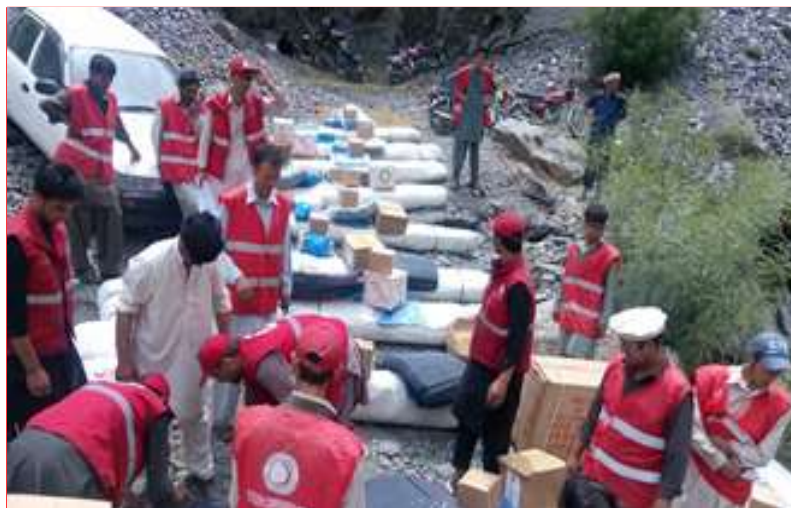
Distribution of NFIs by PRCS in flood-affected areas in Chitral district.

The PRCS has developed a Monsoon Contingency Plan 2015 which has guided the development of its response actions. In the past ten years, the National Society has trained a core group of disaster response team members at national, provincial and district levels, equipping them with skills to effectively carry out the response activities. The PRCS also has preparedness stock for 35,000 families prepositioned in strategic locations across the country, available for quick deployment to the target areas. From PRCS headquarters in Islamabad, coordination with field teams, Red Cross Red Crescent Movement Partners, the NDMA and Provincial Disaster Management Authorities is taking place.