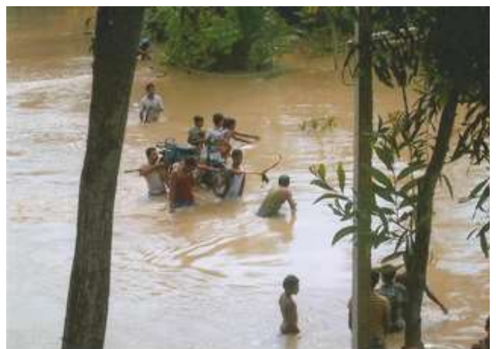
People evacuated from their homes in West Bengal.

In Assam , the state disaster management body (ASDMA) reported that incessant rains since early August have caused several rivers to overflow, inundating villages and damaging standing crops. ASDMA estimates that 80,000 people were affected,