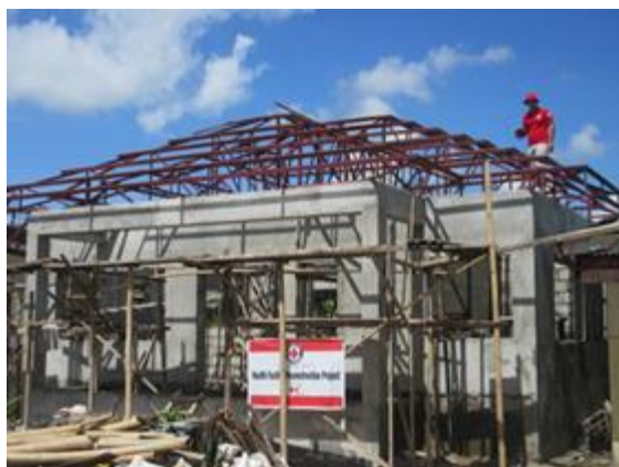
On-going rehabilitation of the Barangay Health Station in the municipality of Malinao, Aklan province

awaiting handover to the local government units, to be run by local health officers. Furthermore, 13 other facilities are currently being rehabilitated/constructed. The facility to be constructed in north Cebu is still awaiting confirmation from the local government for its proposed location.