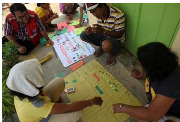
PRC, through this appeal, supports local communities in doing seasonal calendar mapping to support risk reduction and preparation measures in communities.

In addition, IFRC also funded and supported the first NDRT training for shelter and settlements for 25 PRC staff members, held in Cebu on May 2015. 2 security management trainings were also conducted for some 50 PRC and PNS staff, as well as IFRC delegates, including the country head of delegation, facilitated by the Geneva security unit. As PRC prepares to support other National Societies in the region, an international mobilization and preparation for action (IMPACT) training was also conducted for some 30 PRC, IFRC and PNS staff members. IFRC also supported regional logistics management training for PRC/IFRC Haiyan staff, wherein some 90 staff members have completed the training and some 60 more to commence. IFRC facilitated the trainings, which aim to ensure a pool of skilled logisticians for present and future disasters. Training for PRC and PNS drivers in Leyte, was also supported by IFRC.