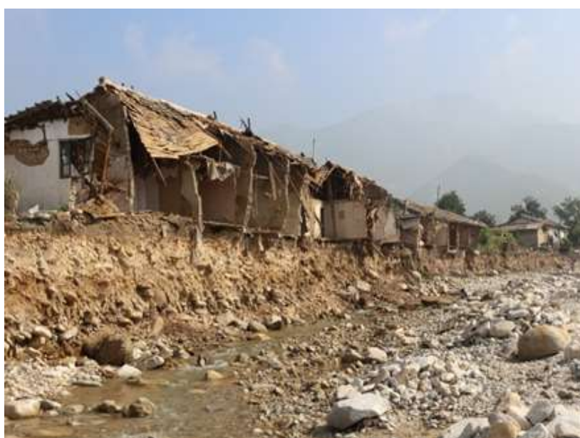
Damaged houses in Haeju City, South Hwanghae province, 12 August 2015.

Torrential rains have caused floods in several Ri-s (villages) and in the outskirts of cities of south Hwanghae and north and south Hamgyong provinces of Democratic People's Republic of Korea (DPRK) between 1 st and 5 th August 2015. In a short span of time, 180 mm to 330 mm rain was recorded in Toksong, Kimchaek, Kilju, Myongchon and Byoksong counties. Hard on the heels of severe drought (reportedly the worst in a century), dry rivers, estuaries, canals could not drain the huge volume of water and overflowed causing floods in settlements, cultivated areas and the destruction of properties and infrastructure. In hilly areas, the strong flow of water washed away houses. The lack of an effective early warning system in the affected Ri-s contributed to delayed response and evacuation, and led to increased loss of life, injuries and damage to houses and infrastructure.