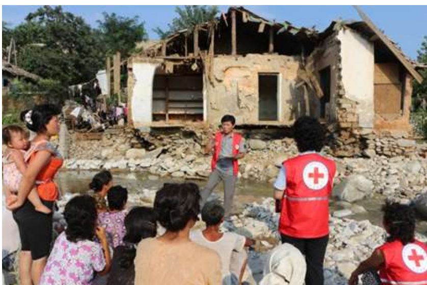
DPRK RCS PDRT members and volunteers conducting rapid needs assessment in flood affected Haeju City, South Hwanghae province, 7 August 2015.

Immediately after receiving reports of the floods from affected local branches, DPRK RCS activated its floods contingency plan. The contingency plan triggered the deployment of National Disaster Response Teams (NDRTs) to three of the worst impacted areas (Haeju city and Byoksong county, south Hwanghae province) to conduct initial needs and damage assessments. Following the initial assessments, the DPRK RCS Disaster Management Department visited the affected areas in order to gather more information and inform appropriate response decision. Based on the assessments and field visits, the DPRK RCS, in coordination with the IFRC Delegation, has released non-food items 1 (NFIs), from its disaster preparedness stock that is prepositioned across the disaster prone provinces. The NFI package combined with a one-month food ration provided by the government was distributed to the most affected people.