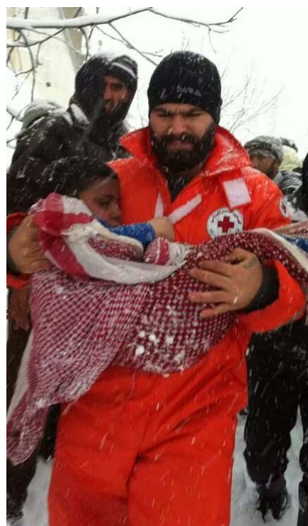
LRC volunteer rescuing a child from the snow storm in Lebanon

The Lebanese Red Cross mobilized 400 Emergency Medical Team System all over the country. 60 4x4 Ambulance Jeeps and 40 regular ambulances were mobilized to transport 1,919 people (including dead bodies: those affected by car accidents, cardiac patients and injured). Four dispatch stations with 5 dispatchers covered the operation and responded to emergency calls. Moreover, a big number of home to hospital transports for patients with chronic diseases were mobilized. LRC transported patients on dialysis who otherwise wouldn't have been able to reach the hospitals for timely treatment. Additionally, the operation supported 100 volunteers with snow gears, 420 with food for 6 days, supplied 25 stations with extra sets of snow chains and 35 stations with fuel for heating and maintenance costs to 25 ambulance stations. Change in budget lines were required due to higher costs incurred for ambulance maintenance.