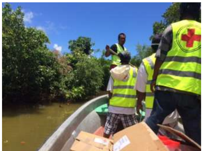
Travelling on boat to reach those in remote areas with relief distribution.

The Government of FSM have released USD 1.5 million to support the relief effort with this expected to cover immediate food, water and NFI distributions. The USAID, who had supported with an initial grant of USD 100,000 to the FSM Government from their Disaster Emergency Fund, are anticipated to announce support to longer term relief and recovery operations through the Compact of Free Association that exists between FSM and the United States.