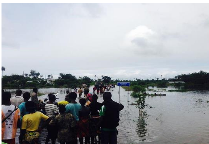
Flooded road between Kenema and Freetown

Sustained heavy downpour of rain from the 5 to the 6 September 2015 (48 hours) burst river banks and caused destruction in eight communities in Bo and two in one Chiefdom in Pujehun District in southern Sierra Leone. The overall population in the three chiefdoms in Bo District is 8,695 of which 2,630 were directly affected losing properties and being exposed to rain with no appropriate sanitation and some evacuating and taking shelter in nearby schools. The number of people affected by the floods in Bo District is 2,630 in 239 household heads with 463 males 614 females, 645 boys, 607 girls and 301 children under five years. A total of 339 houses are reported destroyed. Pujehun District has 272 persons affected by floods with 41 household heads affected losing 16 houses.