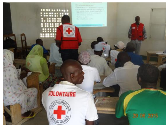
Training of Kourgui local committee volunteers in prelude to response actions

The IFRC, on behalf of the Cameroon Red Cross, would like to thank all those that have contributed to this Emergency Appeal, including British Red Cross, Canadian red Cross and Government, Japanese Red Cross Society, Red Cross of Monaco, Spanish Red Cross and Swedish Red Cross.