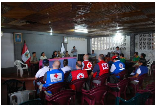
The National Society participated in a joint assessment mission with UN Agencies, Movement components and NGOs.

developed with other humanitarian organizations and governmental offices such as the Ministry of Health. A similar structure of coordination is established at the regional level, with the PRC's Maynas branch in direct contact with Loreto's governmental authorities and actors.